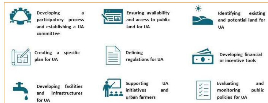
Table 2: Main policy recommendation to plan with and for urban and peri-urban agriculture. (Except from Politecnico di Torino, 2023)

In conclusion, the toolbox for planning with and for UA includes inventories of available land, strategic and statutory plans, regulations, incentives (fiscal, or technical), and assessment tools. To support city authorities in the integration of UA into public policies, the EFUA Project proposes guidelines and recommendations (see Politecnico di Torino, 2022; Table 2). A clear identification of the desired benefits of UA should guide policy design (see article by Gottero, p. 9), guiding the choice of the UA Type and its possible location. Professional and non-professional farming deserve differentiated policies. A participatory approach, from the outset, can help – such as, for instance, creating a