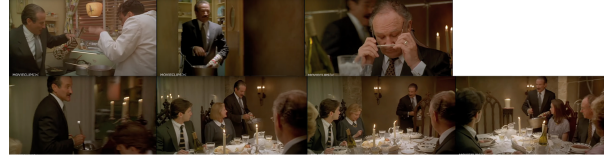
Figure 9. Segment from the birdcage. For a better visualization https://www.youtube.com/watch?v=1pJyWLQLzcA , from 1:00 to 1:30

In some cases, the sequences identified by the same label, while they look alike from a segment representation visually, are different. We can show the reason behind this issue with a unique segment 10. This segment is represented with all medium shots. However, the shot sizes vary. This is because the medium shots shown are at the extremities of the medium shot class. Hence one looks more like a close-up while the other one looks more like a long shot. To overcome these issues, a more fine-grained shot size classification system could be implemented while also including more features from the AVE dataset, such as number of people and camera movement . These countermeasures would also enrich the data representation allowing us to charac-