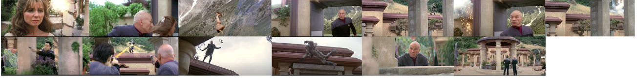
Figure 6. Segment from StarTrek. For a better visualization https://www.youtube.com/watch?v=-1gCG8m1SHU , from the 0:30 to 1:00