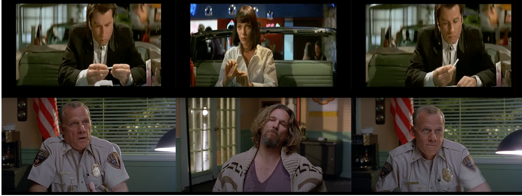
Figure 2. Shot reverse shot extracted from "Pulp Fiction"(top) and "The Big Lebowski"(bottom).