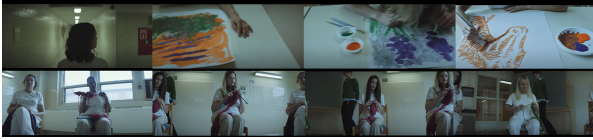
Figure 8. Segment from Thoroughbreds https://www.youtube.com/watch?v=1bBOUr7rAHw , from the 0:30 to 1:00

humans, usually representing dialogues. In this scene, we have a much slower pace with respect to segment 1 and the focus is more on the characters rather than the global context. If we take two segments from different classes that come from the same basic editing pattern cluster we notice fewer differences. The segments shown in 1 are extracted from class 43, which is entirely created from basic editing set 8. The complete segments are reported in Figure 8 and in Figure 9. The scene segment represented in both cases contains mainly medium shots of people interacting with objects. The fact that the two segments end in the same way is partly coincidental. By this, we mean the segments represented by a class can have varying structures as long as they stay within the limits indirectly defined by the editing pace and trend labels.