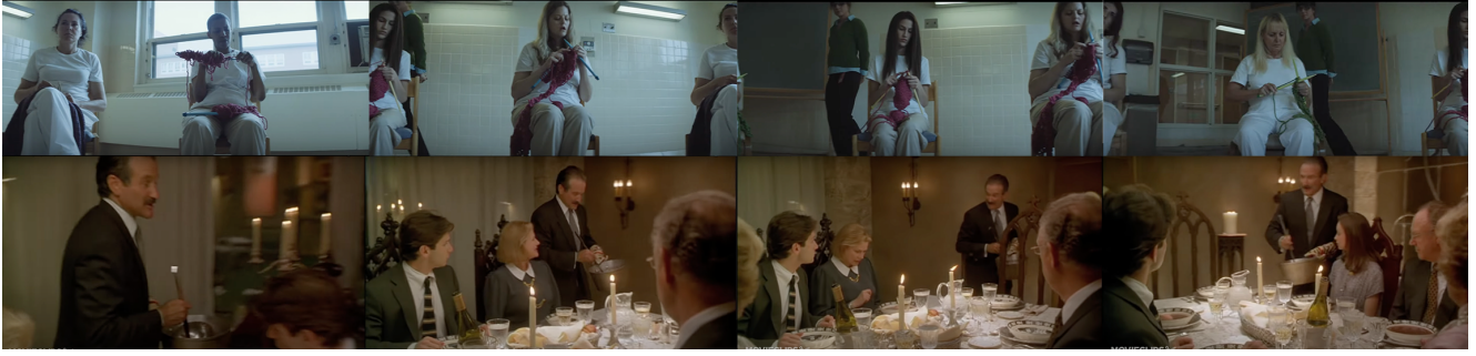
Figure 1. Camera movement showing people interacting with objects from "Thoroughbreds" (top), and "The Birdcage"(bottom).