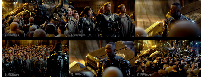
Figure 10. Segment from Pacific Rim. For a better visualization https://www.youtube.com/watch?v=-7Sow81yi24 , from 1:30 to 2:00

terize more complex editing patterns. Another issue is that even if LEMMS can identify more defined labels, there are not enough data examples for the LSTM classifier to learn and thus properly validate them. Thus, if we want to identify more labels and their corresponding segments, we need to increase the amount of data to be analyzed.