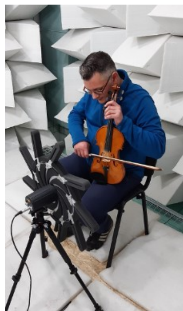
Figure 2. Experimental set-up for the identification of sonic sources.