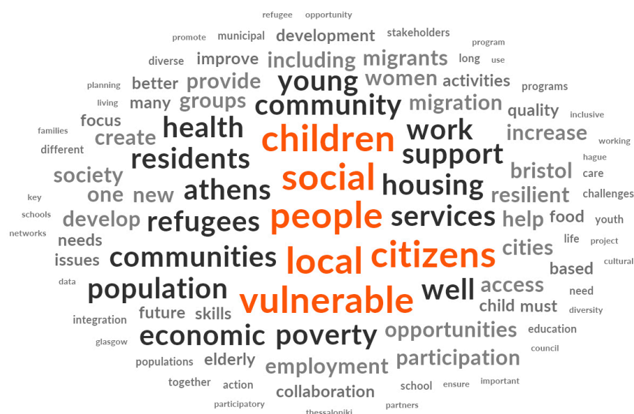
Figure 3. Word cloud of the most emergent themes when analysing the codes extracted regarding the social equity issues in all ten documents—elaborated by the authors.

This study explores three main dimensions of social equity: distributional, procedural, and recognitional. In political theory, for decades, justice was only applied to distributional relationships [45–47]. This view defines justice as the fair distribution of social goods. However, more recent theorists [47–51] challenge this traditional idea and articulate justice as a balance of more interlinked elements. Schlosberg [48,49] claims that justice, “in political practice, is articulated and understood as a balance of numerous interlinked elements of distribution, recognition, participation, and capability”. In other words, he tries to provide a more comprehensive understanding of justice by addressing the importance of individual and community recognition, participation, and functioning. The current study adopts this multi-dimensional definition of justice. This view on justice and equity argues that—in addition to the distributive dimension—it is also necessary to address the processes that might lead to maldistribution, respect, and recognition, which are “necessary preconditions to any theory of procedural justice” [50].