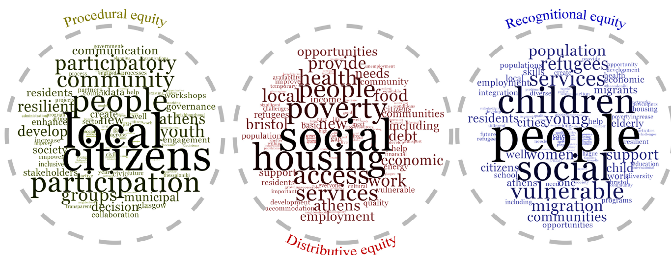
Figure 4. Word cloud of the most emergent themes extracted from the study’s coding effort regarding the three dimensions of equity—elaborated by the authors.