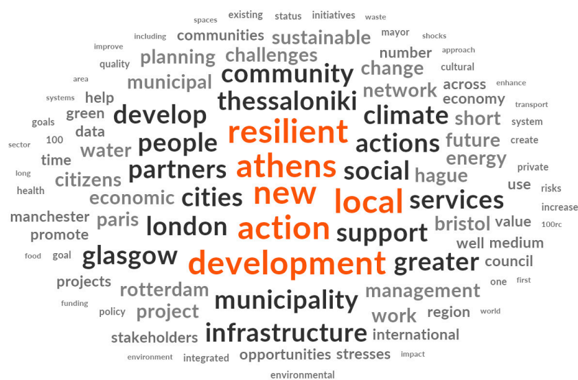
Figure 2. Word cloud of the most emergent themes when analysing the whole content of all ten documents—elaborated by the authors.

Initially—based on the first question—we explore relevant patterns and trends related to the issue of equity within the resilience plans. To clarify, Figure 2 shows the word cloud of the most emergent themes when we analyse the whole content of all ten documents, while Figure 3 shows the most emergent words regarding the social equity issues in the documents.