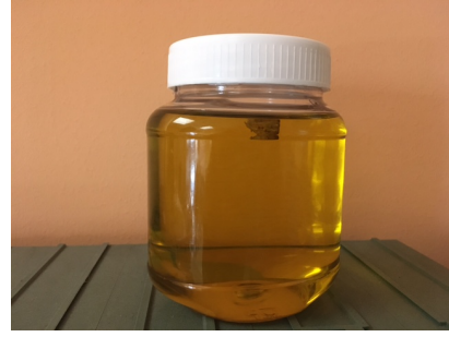
Fig. 1. Plastic jar filled with commercial oil with wooden foreign body used in experimental testing.

An optimized sequence of antenna pairs is selected to cover the region of interest, following the considerations of the previous section. The antennas' radiation is obtained numerically, considering the oil dielectric properties and the positions as input for the imaging algorithm. This is done to compute