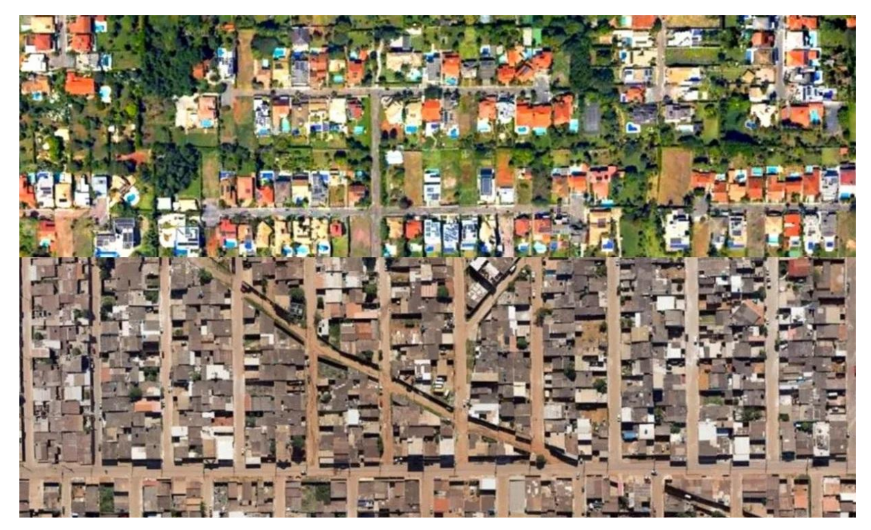
Image 2 | The contrasting access to Nature in the "Plano Piloto" and the favela "Sol Nascente" (bellow).

In addition, James Holston (1996) developed a famous anthorpological critique of the project of Brasília, highlighting its modernist logic. His main critique is not about the image, but against its method: an all-powerful republican state; the imagination of a solid future in complete rupture with the past; the image of geniuses inventing a more truthull and rational world; and the apolitical negation of context and tradition. In a different perspective, he shows how the history of the city was a history of conflicts. From the beggining the population who built the city inhabted against its hegemonic logic, in continuous rebellions and insurgent practices. He argues that the real politics of the city was developed in these other ways of producing its territory.