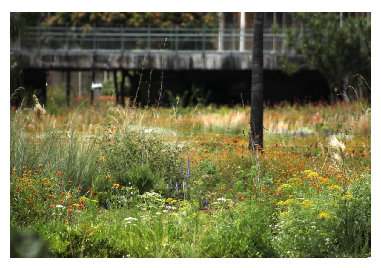
Image 3 | Experiments in a renewed Cerrado Landscape.

A century ago when the renowned anthoprologist Claude Lévi-Strauss (1961) visited the region, not even his acute sensibility could see beauty in this nature. He saw the Cerrado as a «desert» of «half dead ground, half battlefield [...] where nothing grew but rough grass and thorny shrubs». Therefore, to reimagine the landscape of the Cerrado is also to revalue it. It is an aesthetical procedure in the sense of Jacques Ranciere (2000): a polical process of seeying this nature in a new way.