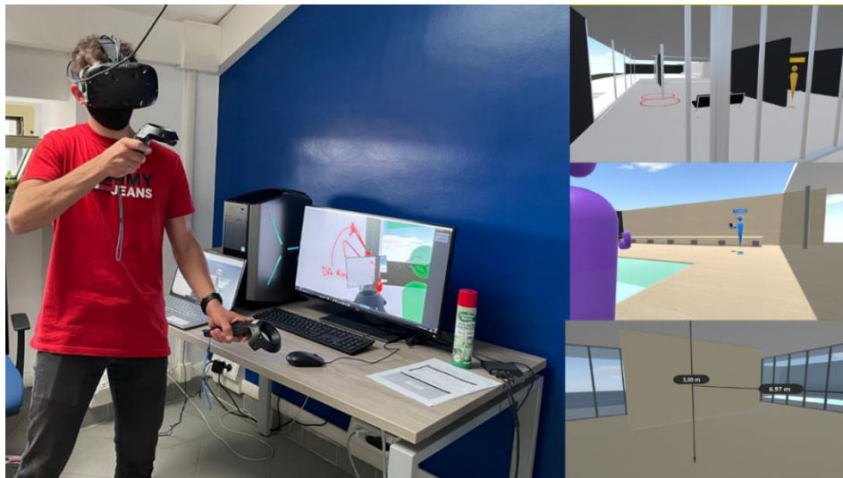
Figure 3. Immersive Virtual Reality experience for project reviews.