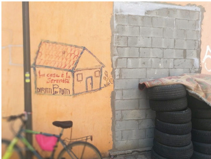
Fig. 7.1 A door bricked up after the eviction of one of the squat's buildings. Next to it, a graffiti reads: "Home is peacefulness. Rights for everybody".