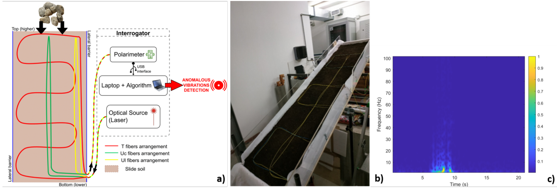
Figure 1: a) Block diagram of the system, b) picture of the slope scale model, c) spectrogram of the resulting \omega(k) evolution during a single rock fall event (linear spectral amplitude normalized to 1).

We started our algorithm optimization by selecting the proper sampling rate f_s : in Fig. 1c, we report the spectrogram of the resulting \omega(k) evolution during a single rockfall event happening about 7 seconds after the beginning of the acquisition. The graph clearly highlights that the relevant spectral information is below 40 Hz, a value that was confirmed also for the other rockfall acquisitions [9], [10]. Consequently, a sampling frequency f_s = 95.4 Hz was found to be sufficient: such a low value allows to greatly limit the amount of data to be processed and stored in an application where constant endless monitoring is needed. As clearly outlined in [11], reducing the overall size of the dataset is crucial in these applications that should run 24/7.