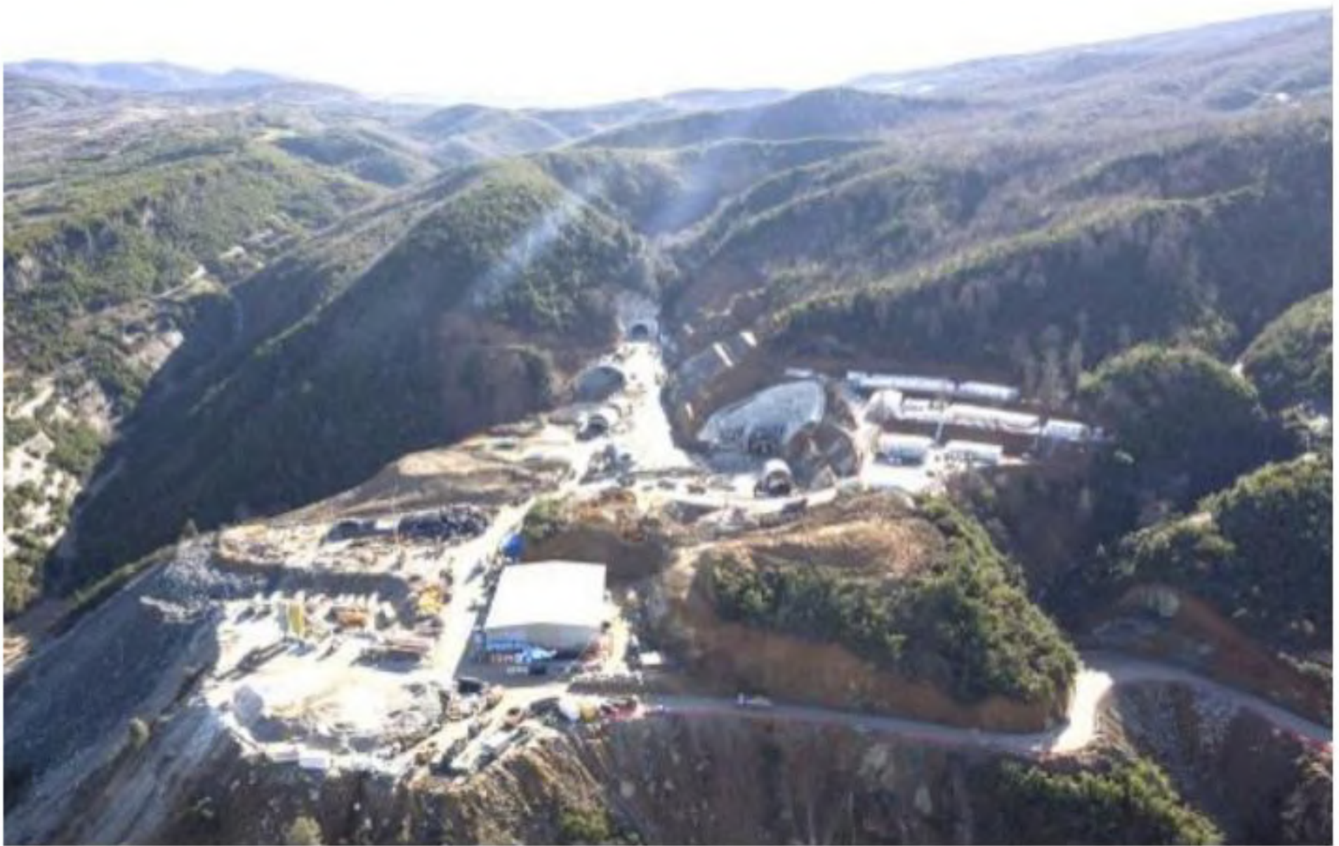
Fig1 / the New Highway Tirana - Elbasan under construction from KLM 2+850 (distance counting starting from Tirana) up to the Entrance of the Krrabe Tunnel KLM 15+650

to develop the “hyperNatural” attitude and re-design the future landscape as something new and original.