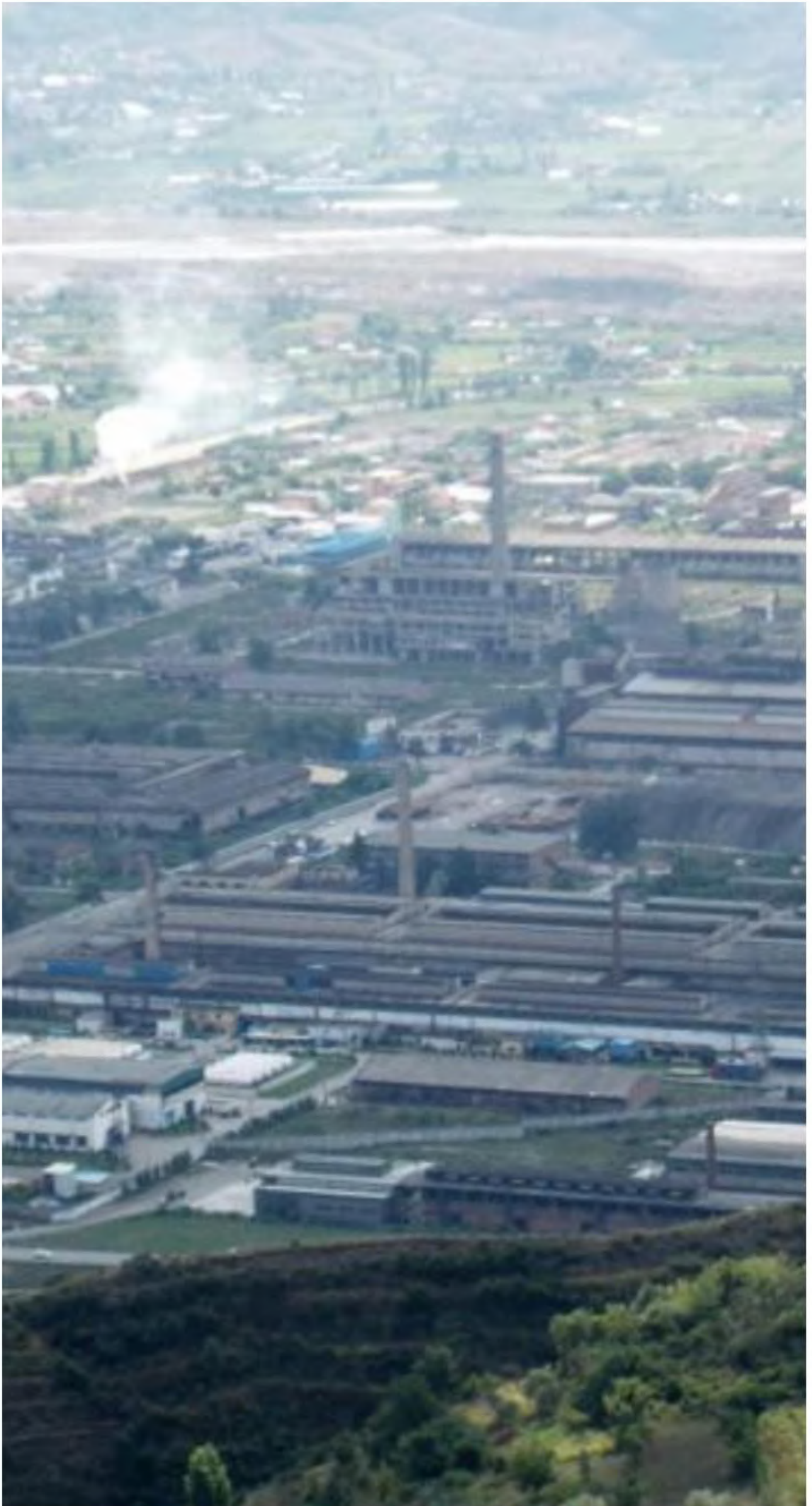
Fig2 / aerial view of the Elbasan metallurgical complex built in 1974 and called the "Steel of the Party"