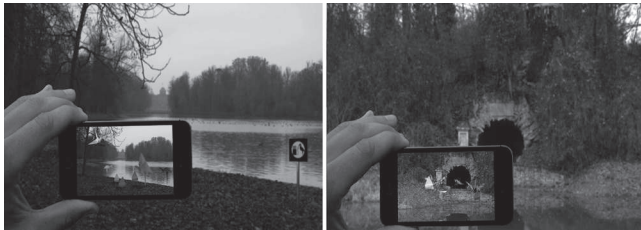
Figure 1-2. the Royal Park of the Castle of Racconigi, Piedmont, Italy. Coloured digital storks in origami form appear using the AR app “ARTgo” installed on a mobile device (photos property and courtesy of Diego Repetto. Authors’ elaboration).

All of this has reinforced the intra-pandemic approach to cultural property enjoyment, which has led to an increasing decoupling of content and container from traditional forms of enjoyment. Analyzing monitoring data of World Heritage sites closed due to Covid-19 in 167 countries (as of December 7, 2020), only 47% kept them open, 22% shut them down completely, and the remaining 31% opted for partial closure (UNESCO, 2020). In this context, technological innovation in the remote