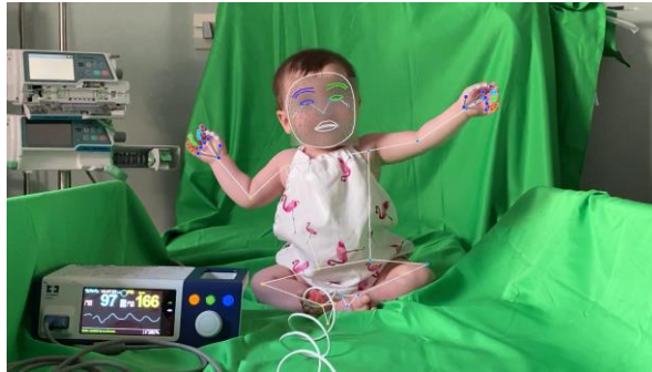
Fig. 1. Example of a frame of a video in our collected dataset, where landmarks provided by GMH are visualized. The image has been postprocessed to anonymize the child’s face.

For each frame of a video, GMH provides 543 landmarks (33 pose landmarks, 21 hand landmarks for each hand, and 468 face landmarks) [23]. It also allows setting a minimum confidence value for the detection and tracking of these points; in our system, we set these values to 0.5, so that we kept as valid landmarks only the ones with confidence higher than 0.5. For a set of landmarks, we will call a frame where those landmarks are valid a “valid frame”. For what concerns the format of coordinates of the landmarks, we chose to use the coordinates that GMH provides in the image reference frame. Each landmark is identified by a set of 3D coordinates (x, y, z) ; in our analysis we used only x and y coordinates, and not the z coordinate, being an estimation of the depth of the point made by GMH. Fig. 1 shows an example of a frame of a video in our collected dataset, where landmarks provided by GMH are visualized.