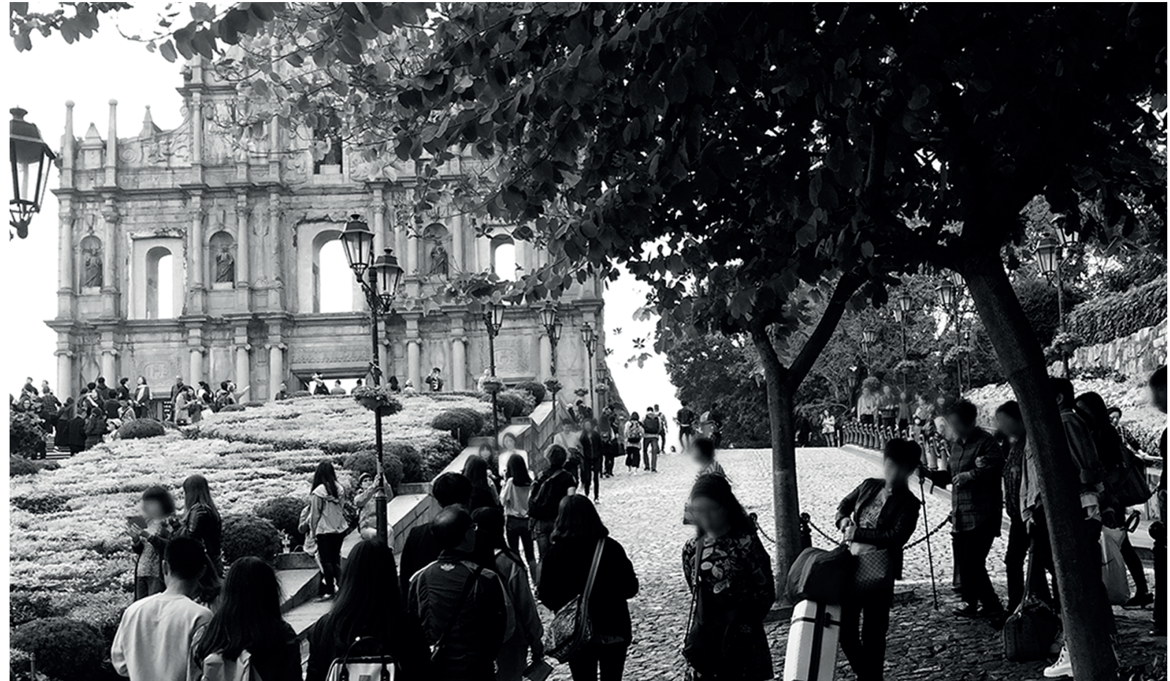
Ruínas de São Paulo, Part of the Historic Centre of Macao (China) in the world heritage list