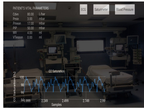
Fig. 3. Image of the user's view through the AR glasses.

glasses is relatively low (in the order of 500 Euros); hence, it anticipates the possibility of a large-scale use. A dedicated Android application (running on the Moverio BT-350) was specifically developed by the Authors, aiming to receive the vital parameters from the instrumentation via TCP/IP protocol. The used ventilator is the Drager Infinity V500, while the patient monitor was the Drager Infinity V500. Both these pieces of equipment are generally available in the operating room; hence, they represent an interesting case study.