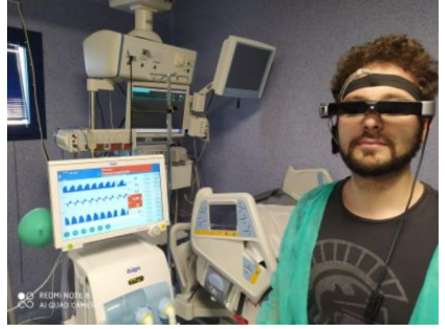
Fig. 2. Picture of the experimental validation.

The OST headset is the Moverio BT-350 AR smart glasses. The perceived screen size of the glasses is 2 m at 5 m projected distance, with a refresh rate of 30 Hz. The cost of these