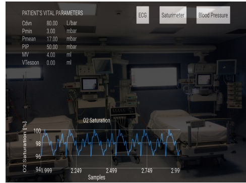
Fig. 3. Image of the user's view through the AR glasses.

glasses is relatively low (in the order of 500 Euros); hence, it anticipates the possibility of a large-scale use. A dedicated Android application (running on the Moverio BT-350) was specifically developed by the Authors, aiming to receive the vital parameters from the instrumentation via TCP/IP protocol. The used ventilator is the Drager Infinity V500, while the patient monitor was the Drager Infinity V500. Both these pieces of equipment are generally available in the operating room; hence, they represent an interesting case study.