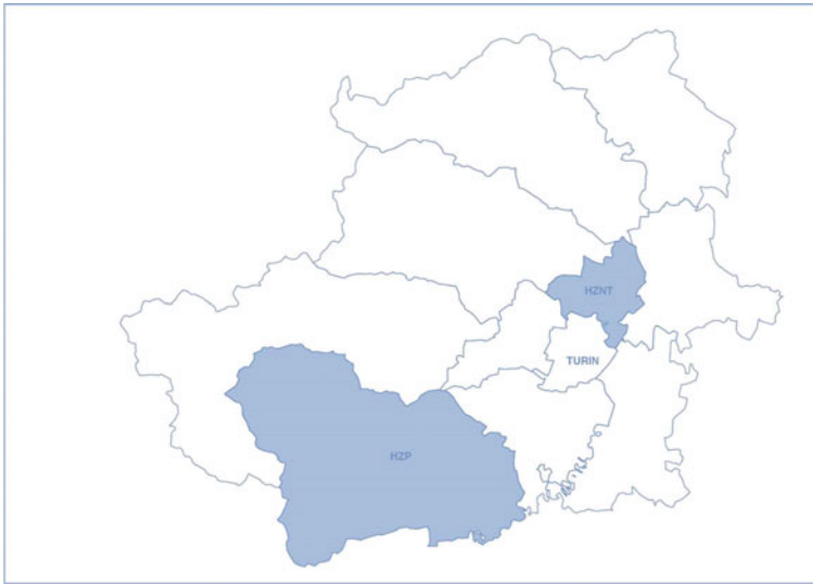
Fig. 9.3 Location of HZP and HZNT homogeneous zones in the territory of the Metropolitan City of Turin, Piedmont, Italy

some adaptation actions), ClimeApp shows how much the risks are reduced for this municipality in comparison with the risk levels of the others.