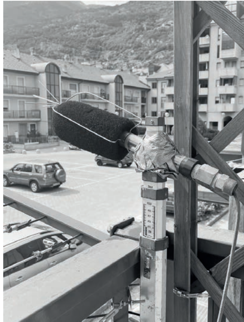
Physical environment measurement in social housing, Aosta, Italy