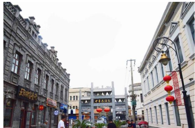
Figure 1. Well-renovated and upgraded area in Daowai district after the first phase of the renovation project.

people were forced to relocate from their live-since-born houses, which caused tension and widespread discontent (Zhang, 2021). In particular, hard-to-access residents, as minority groups, due to the highlighted ethnicity, religion, disabled issues, etc., were largely ignored in the heritage management process. Decision-making processes related to heritage management should be inclusive and involve the participation of broader communities. Research on revealing people's stories and preferences concerning the Chinese historic urban landscape in their visiting and living experience is needed to address this concern directly.