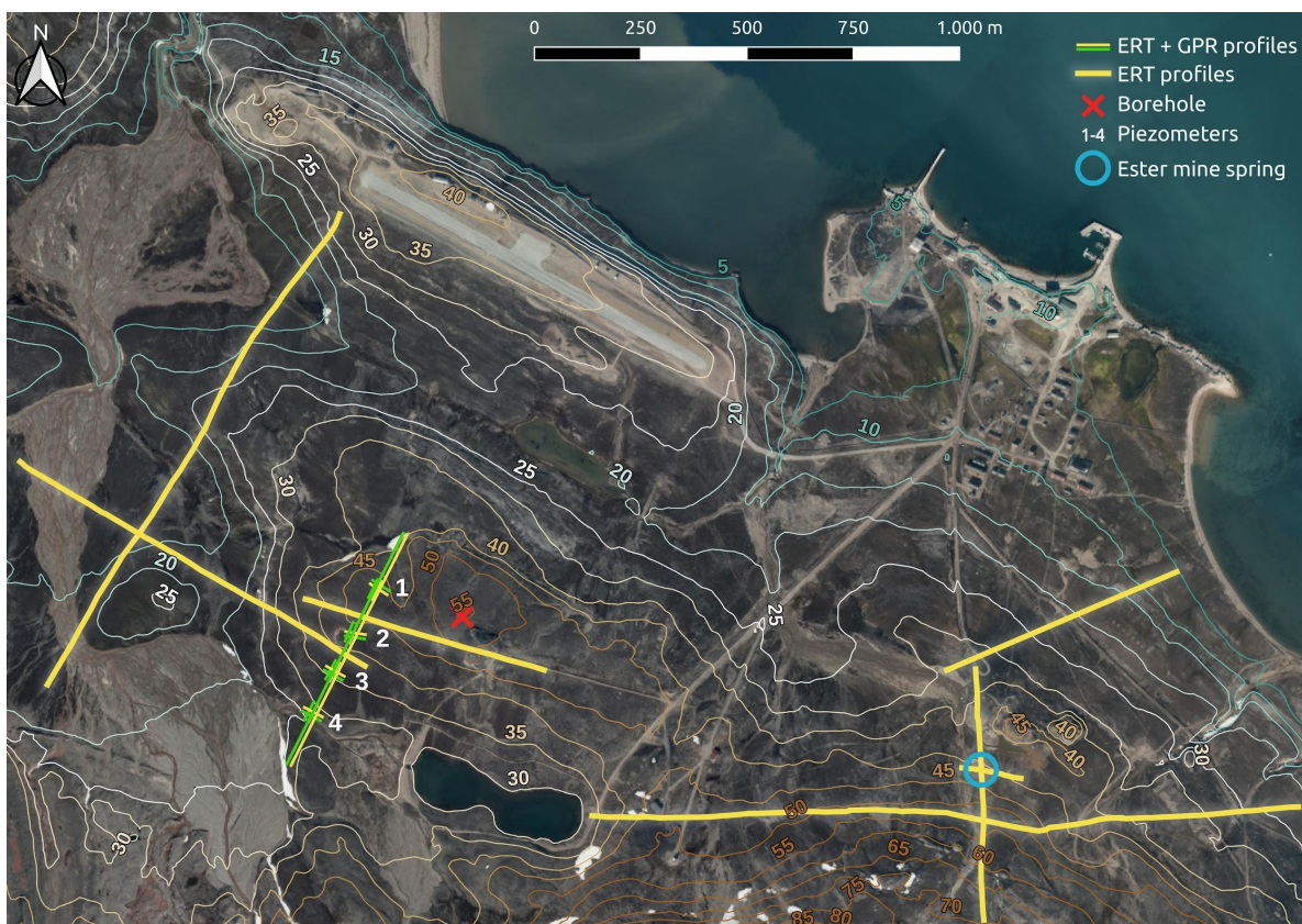
Fig. 1 – Map of the geophysical campaign carried out in Ny-Ålesund (Svalbard) in the summer of 2022. The ERT profiles are plotted in yellow and the GPR profiles in green. The investigated area on the west is the Bayelva river basin, while that on the east is the former mine. The piezometers are indicated with white numbers. The red cross is a recent borehole (48.5 m deep). The blue circle indicates the position of a spring (Haldorsen and Heim, 1999).

GPR measurements with 40 MHz and 400 MHz antennas were carried out in the area of the Climate Change Tower, close to the four piezometers aforementioned, for a total of around 2 km of GPR lines. Coincident ERT and GPR profiles with different acquisition settings were designed along the line of piezometers in order to correlate the geophysical results with the geochemical data and water table information coming from the piezometer monitoring (see Fig. 1).