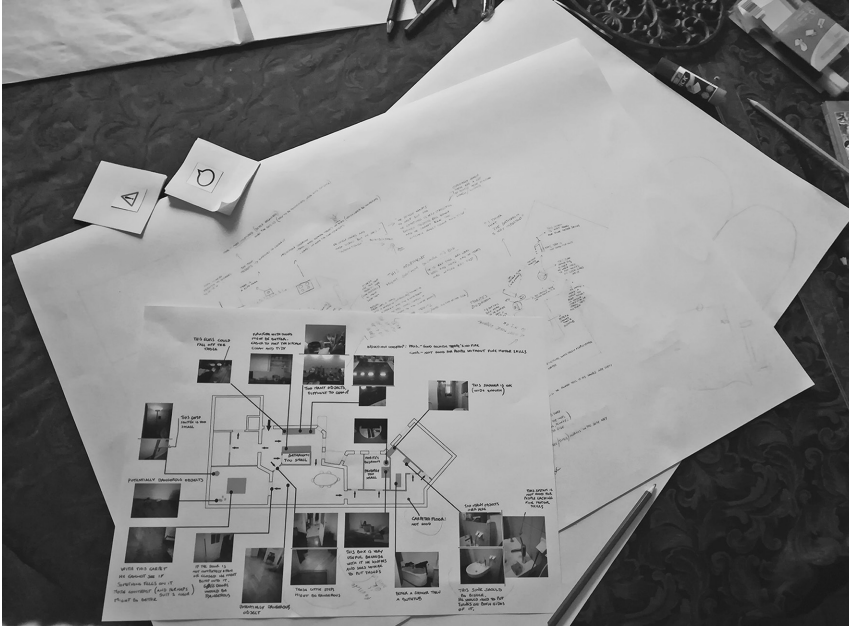
FIGURE 14.2 House exploration.

Figure 14.3), sound recordings—later merged together and adjusted to blur contrast between different sounds—and worker gloves to experience other ways of touching and handling things.