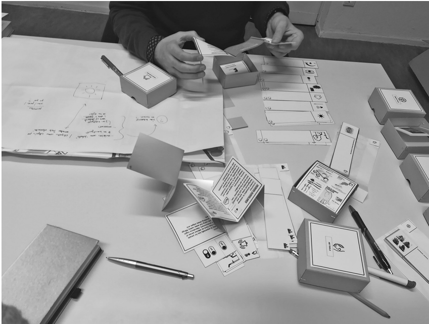
FIGURE 14.1 Research on existing methods and tools.