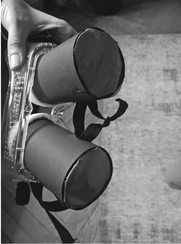
FIGURE 14.3 Prototype of binocular lenses.

Care is taken here as willingness to take on risks and learn to be affected, moved, touched by what matters for other beings (Despret 2004). Against the encyclopedic approach of Neufert's handbook, our Re-thinking design is intended to be a sort of open cookbook, meant to collect countless experiments. Stable guidelines become open recipes, and their abstract nature will be replaced and enriched by progressive findings and rearrangements, brought forward by different experiments. Once again, the focus on documenting the whole experience of crisis, thus including doubts, failures, and different attempts to deal with the issues encountered, is set on the conviction that what care brings to design goes beyond a moral imperative to provide inherently good and definitive solutions. Conceived as the ability to be exposed to the unknown, it rather transforms design in a speculative process, through which one can recursively reflect on and unsettle the potentially harmful ways in which architects have been trained and are used to practicing their profession.