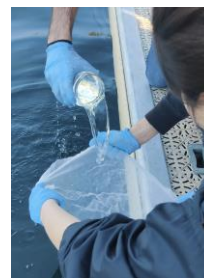
Img 2: AKANoah Team member during a Po river sampling