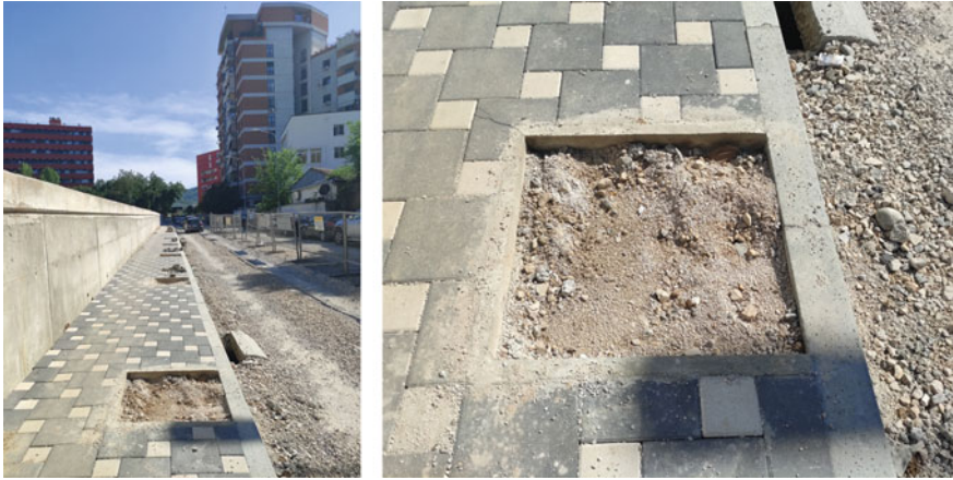
Fig. 11.3 Project for new Green infrastructure added to the renewal of the road surface and pedestrian pavement in Rruga Dora D'Istria in Tirana, Albania. The width of the pavement is 2 m, while the distance between the two tree boxes is around 5 m.

Callery pear, judas-tree, Carpinus Orientalis , and common Hibiscus were planted, and other specimens of Viburnum Lucidum followed in 2022.