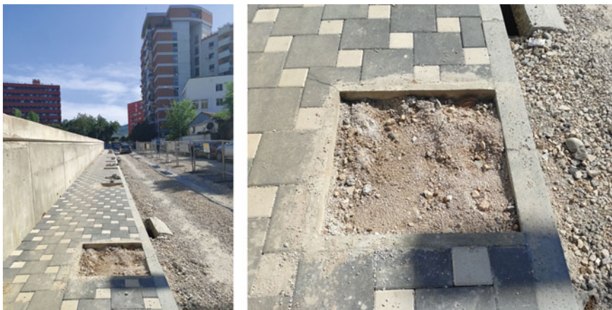
Fig. 11.3 Project for new Green infrastructure added to the renewal of the road surface and pedestrian pavement in Rruga Dora D'Istria in Tirana, Albania. The width of the pavement is 2 m, while the distance between the two tree boxes is around 5 m.

Callery pear, judas-tree, Carpinus Orientalis , and common Hibiscus were planted, and other specimens of Viburnum Lucidum followed in 2022.