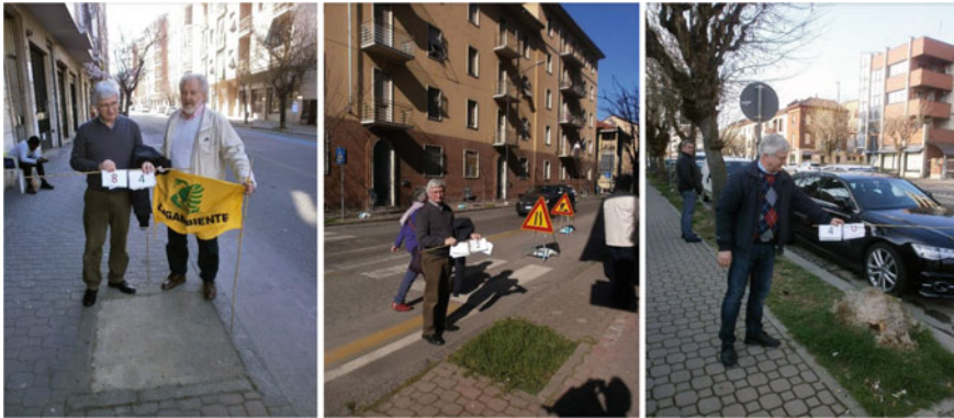
Fig. 11.2 Some photos of the arboreal surveys in the tree-lined avenues of Asti in March 2019. From left to right, a missing tree (Maple negundo ) in a plot later cemented over or left green, while on the right, a felled flowering cherry tree.

actions of sharing management activities to achieve effective rooting and development of the trees over time.” (Osservatorio del Paesaggio per il Monferrato e l’Astigiano 2019a).