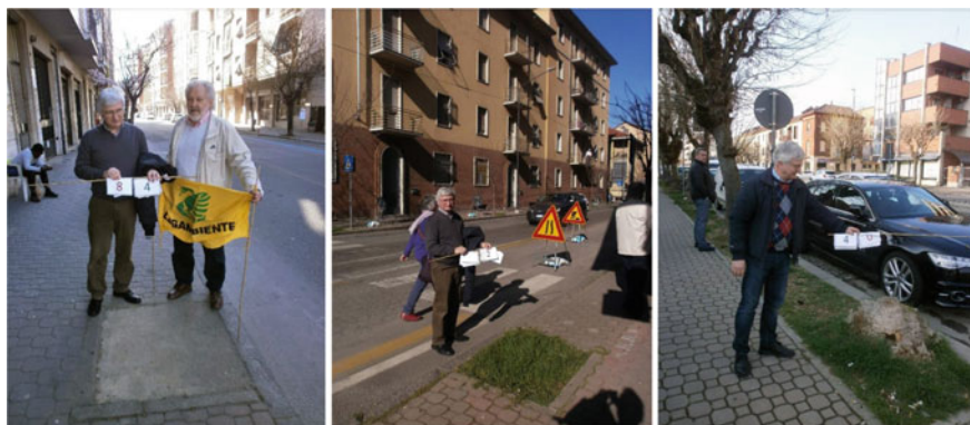
Fig. 11.2 Some photos of the arboreal surveys in the tree-lined avenues of Asti in March 2019. From left to right, a missing tree (Maple negundo ) in a plot later cemented over or left green, while on the right, a felled flowering cherry tree.

actions of sharing management activities to achieve effective rooting and development of the trees over time.” (Osservatorio del Paesaggio per il Monferrato e l'Astigiano 2019a).