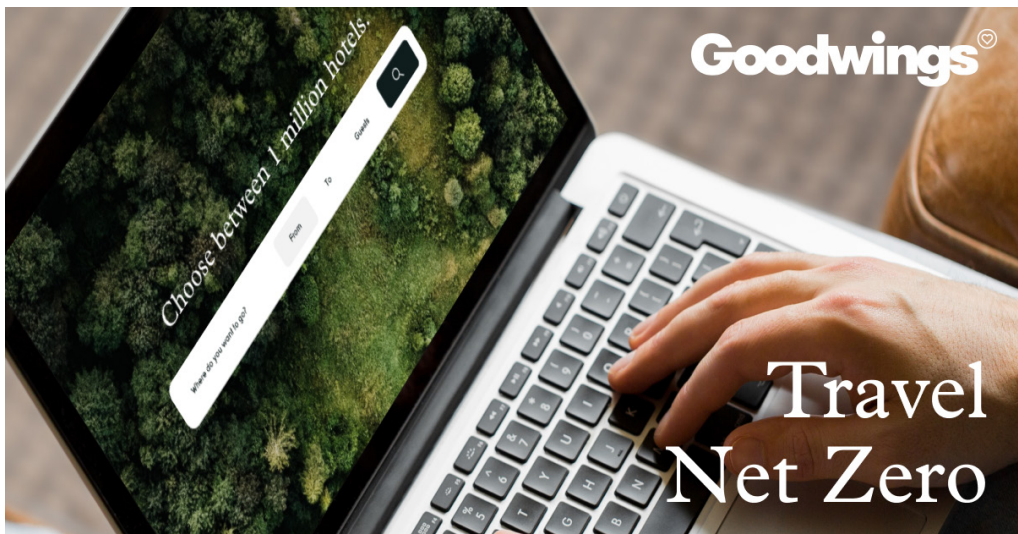
Figure 1. Goodwings B-corp website

In contrast to these actions related to sustainable mobility, which are still quite few and not widely considered, other transformations to which the tourism sector is subject are due to climate change, which characterise the impossibility of travelling to certain areas of the world, for example, or visiting