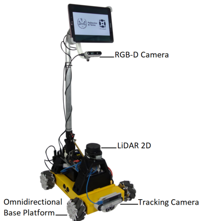
Fig. 2: The omnidirectional platform we set up for experimentation and validation of our novel methodology.