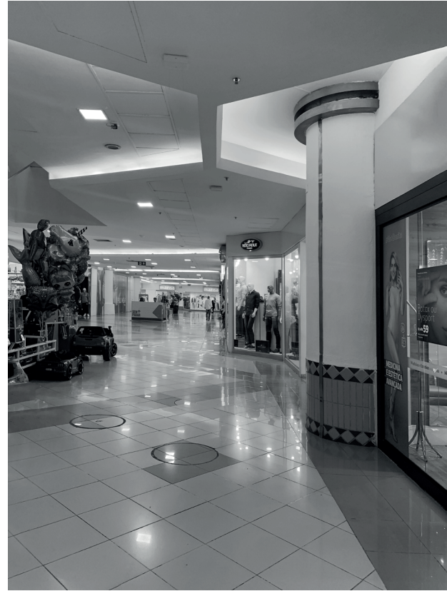
Figure 7 | International Shopping Center Guarulhos interior view of the part that was originally dedicated to the assembling area - © Giuliana Di Mari, 2022.

rather than technocracy. Zanuso found such a concept in Adriano Olivetti's production philosophy to a certain extent. Zanuso's factories for Olivetti were explorations of industrialised architecture. Through their reflection on the approach to architecture, and industrial design, these factories were distinctive investigations into the relationship between architecture and industrial design.