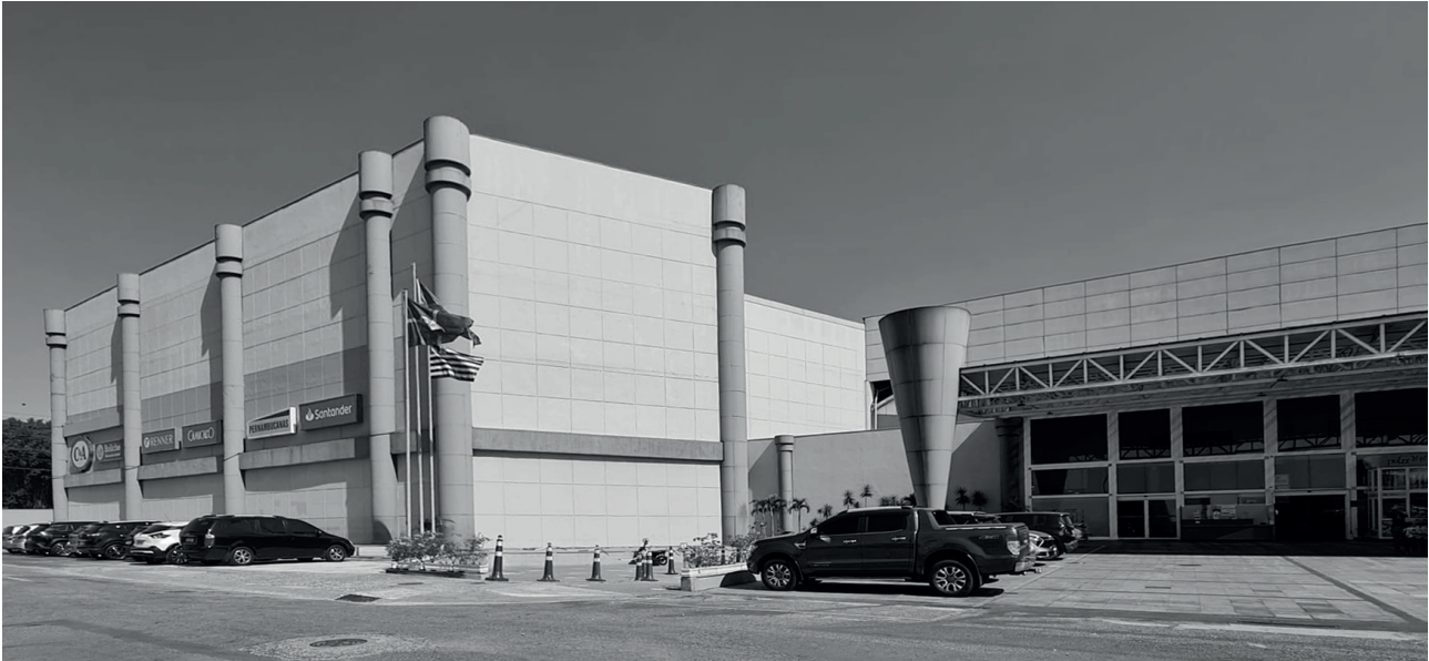
Figure 5 | International Shopping Center Guarulhos entrance today - © Giuliana Di Mari, 2022.

The Brazilian factory is placed into the category of form-resistant structures whose static behaviour is described by Sergio Musmeci as “characterised by stresses contained on the plane tangent to the roof (membrane stresses) whose bond with the loads acting locally on the vault is isostatic” 2 (Musmeci, 1969: 692).