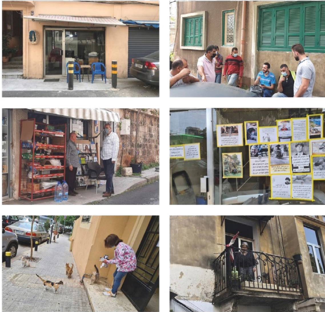
Figure 2 Mapping spaces of exchange.