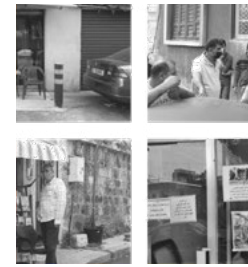
Figure 1 ▶ p. 215

2 Respondents were presented with a total of eight statements, to which they were asked to respond to what extent they agreed or disagreed on a 5-point Likert scale. The statements were the following: I feel like I belong to this neighbourhood; The friendships and associations I have with other people in my neighbourhood mean a lot to me; If I needed advice about something I could go to someone in my neighbourhood; I borrow things and exchange favours with my neighbours; I plan to remain a resident of this neighbourhood for a number of years; I regularly stop and talk with people in my neighbourhood; People around here are willing to help their neighbour; and People in this neighbourhood can be trusted.