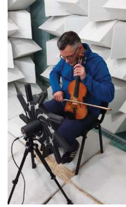
Fig. 3. Acoustic characterization experimental set-up.

The previously identified global modes were well detected experimentally above \sim 600 Hz. Unfortunately, the sound source localization is not good at lower frequencies due to the presence of non-linear effects. However, those mode shapes can be qualitatively identified at frequencies multiple of their natural frequencies. An example of good correlation between numeric mode shape and sound source localization is related to the mode, whose vibration is concentrated on the right f-hole top part (Fig. 4), that has a frequency multiple to the corresponding E note at 660 Hz. This proved that the acoustic response at that frequency was mostly related to the f-holes vibration. Further details on the experimental results related to the acoustic characterization applied to the selected violin are reported in the literature [15].