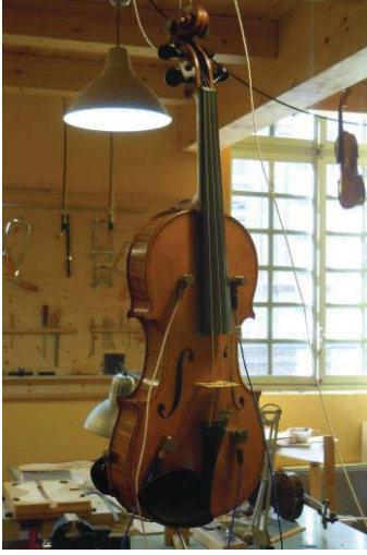
Fig. 1. EMA experimental set-up.

recurring. These frequencies are close, as lower octave harmonics, to the one known as “bridge hill” (being a broad peak response of good violins in the vicinity of 2.5 kHz) [26].