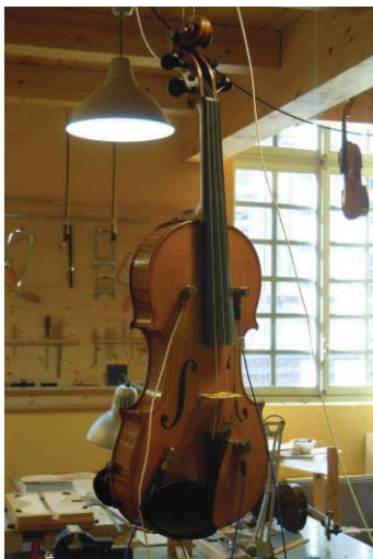
Fig. 1. EMA experimental set-up.

recurring. These frequencies are close, as lower octave harmonics, to the one known as “bridge hill” (being a broad peak response of good violins in the vicinity of 2.5 kHz) [26].