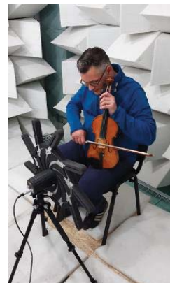
Fig. 3. Acoustic characterization experimental set-up.

The previously identified global modes were well detected experimentally above ~600 Hz. Unfortunately, the sound source localization is not good at lower frequencies due to the presence of non-linear effects. However, those mode shapes can be qualitatively identified at frequencies multiple of their natural frequencies. An example of good correlation between numeric mode shape and sound source localization is related to the mode, whose vibration is concentrated on the right f-hole top part (Fig. 4), that has a frequency multiple to the corresponding E note at 660 Hz. This proved that the acoustic response at that frequency was mostly related to the f-holes vibration. Further details on the experimental results related to the acoustic characterization applied to the selected violin are reported in the literature [15].