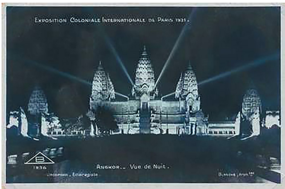
The pavilion of Angkor Temple of Cambodia in International Colonial Exposition in Paris