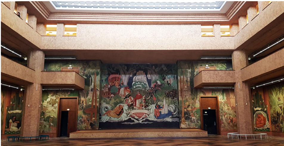
The hall of the museum

As it was a showcase of French colonial empire, the interior circulation of the museum was divided into two sections. Firstly, "Retrospective Section" was allocated to exhibit chronological and historical progress of national colonial movements from Croisades to 1912. Secondly, "Synthesis Section" was conceived to summarize the achievements of the French nation in this process. In addition, the organization of the entire museum was not projected only to list the colonial artefacts or movable objects. The organizers' willingness to display the tropical nature of the colonies ended with designing the basement floor as a place where colonial flora and fauna can be exhibited.