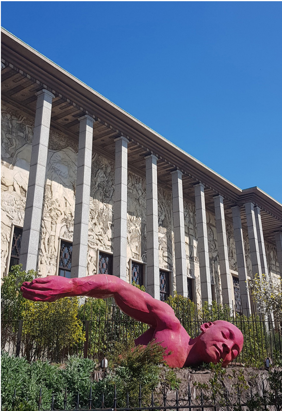
The National Museum of Immigration History

The answer is no with "but"... A few years after its inauguration, the museum shifted its name from Colonial Museum to Overseas France Museum. Under the European interwar political atmosphere, the elimination of "colonial" word was only first step of French desire to overwrite the main aim of museum project. The decolonization period paved the way for the museum to change its name two more times, in the following order, before taking its current name: firstly, Museum of African and Oceanic Arts in 1960; secondly, National Museum of African and Oceanic Arts in 1990. Lastly, in 2017, it received the current name "National Museum of Immigration History" known as also Palais de la Porte Dorée (Golden Gate Palace). The basement still exhibits the tropical fauna and flora with an aquarium. The permanent exhibition replaced with the synthesis of immigration history of France including all over the world countries. Moreover, the second floor is dedicated to temporary modern art and/or contemporary art exhibitions. The main hall hosts various of cultural events such as dance shows, workshops or concerts to promote the multiculturalism and to strengthen the awareness on cultural diversity.