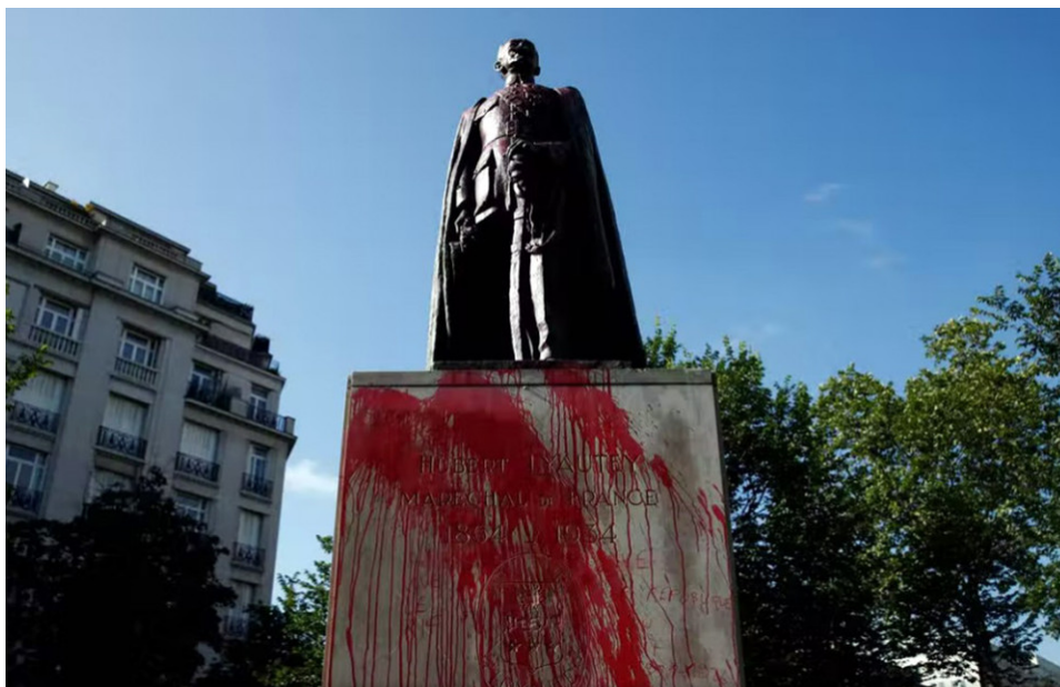
Statue of Lyautey in Paris

In 1931, the last International Colonial Exposition of the world was opened in Paris. It was one of a series of colonial expositions that were held in France in the 1920s and 1930s, as France sought to reassert its colonial presence in the wake of World War I. In the opening ceremony, French actors underlined their particular attention on the conservation of local cultures in French colonies, and how they cooperated with colonized community rather than assimilate them since the beginning of 20th century. In his opening speech, statements such as "there is no racial class difference" and "we must learn to adapt to diversity" were strongly underlined by Marshal Lyautey in charge of the Moroccan Protectorate. In the European atmosphere of interwar period, this stance of French colonialist actors was a sort of justification for their continuous colonialist approaches. However, they have received only a few objections by French society in 1930s. Ironically, Marshal Lyautey's colonialist approach was remembered again during the Black Lives Matter protests in 2020. Almost a century after his performance, which he pretended to promote cultural diversity, his statue in central Paris was vandalized.