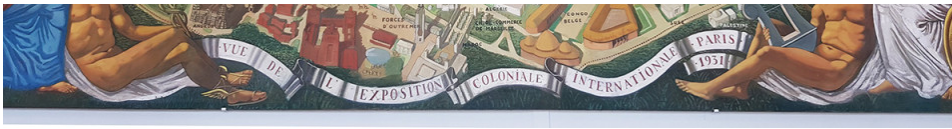
The representation of entire International Colonial Exhibition area in the museum