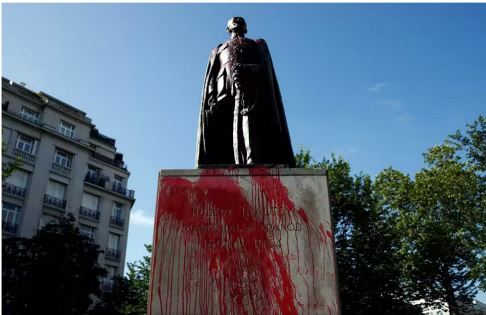
Statue of Lyautey in Paris

In 1931, the last International Colonial Exposition of the world was opened in Paris. It was one of a series of colonial expositions that were held in France in the 1920s and 1930s, as France sought to reassert its colonial presence in the wake of World War I. In the opening ceremony, French actors underlined their particular attention on the conservation of local cultures in French colonies, and how they cooperated with colonized community rather than assimilate them since the beginning of 20th century. In his opening speech, statements such as "there is no racial class difference" and "we must learn to adapt to diversity" were strongly underlined by Marshal Lyautey in charge of the Moroccan Protectorate. In the European atmosphere of interwar period, this stance of French colonialist actors was a sort of justification for their continuous colonialist approaches. However, they have received only a few objections by French society in 1930s. Ironically, Marshal Lyautey's colonialist approach was remembered again during the Black Lives Matter protests in 2020. Almost a century after his performance, which he pretended to promote cultural diversity, his statue in central Paris was vandalized.