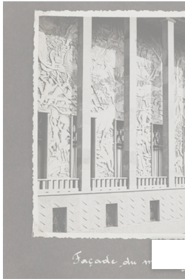
Exposition coloniale internationale de Paris : façade of Bibliothèque Historique de la Ville d

The façade merged the colonial daily lifestyle representation by going beyond the Mediterranean colonies and reaching from Asia to Africa, from America to Oceania. Men and women of colonized community were depicted working in the fields with their animals, in traditional costume and even some dance moves. Fostering the power of mother country, France was allocated in the center of this panorama. This power demonstration dominated every segment of the museum. The all interior design was based on the colonizers' intention to make visible of this desire. The walls were covered with the murals portrayed by prominent French painters. As an extension of external bas-reliefs, these murals combined the traditional life in the colonies once again by emphasizing the "civilization mission" of French. As highlighted by historian Gwendolyn Wright, the desire to make visible how this France brought civilization to the colonies so dominated the architectural project in every dimension that even the description of the building's architect, Albert Laprade, examining the project while the colonial community was working in the jungle, took place in the main hall murals.