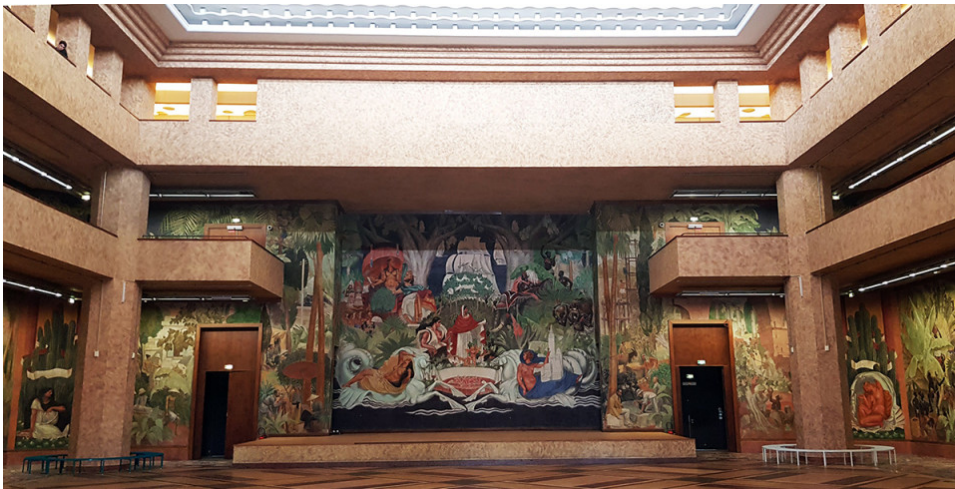
The hall of the museum (Photographed by the author in 29.03.2019)

As it was a showcase of French colonial empire, the interior circulation of the museum was divided into two sections. Firstly, "Retrospective Section" was allocated to exhibit chronological and historical progress of national colonial movements from Croisades to 1912. Secondly, "Synthesis Section" was conceived to summarize the achievements of the French nation in this process. In addition, the organization of the entire museum was not projected only to list the colonial artefacts or movable objects. The organizers' willingness to display the tropical nature of the colonies ended with designing the basement floor as a place where colonial flora and fauna can be exhibited.