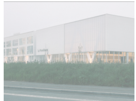
evidence High School

The main logic of the plan of Lyauteyville in Paris was the reconstruction of most famous historical buildings of the colonies. Beaux-Art architects were again in charge of these reconstructions. Many landmarks of colonial territories were projected and their miniature replica was erected in Bois de Vincennes. For instance, Angkor Temple of Cambodia was one of the well-known and most visited pavilion. Besides, the organization has arranged light shows during the night to attract the visitors in the entire day.