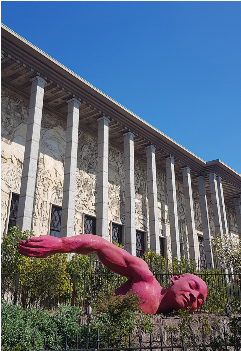
The National Museum of Immigration History (Photographed by author in 29.03.2019)

The answer is no with "but"... A few years after its inauguration, the museum shifted its name from Colonial Museum to Overseas France Museum. Under the European interwar political atmosphere, the elimination of "colonial" word was only first step of French desire to overwrite the main aim of museum project. The decolonization period paved the way for the museum to change its name two more times, in the following order, before taking its current name: firstly, Museum of African and Oceanic Arts in 1960; secondly, National Museum of African and Oceanic Arts in 1990. Lastly, in 2017, it received the current name "National Museum of Immigration History" known as also Palais de la Porte Dorée (Golden Gate Palace). The basement still exhibits the tropical fauna and flora with an aquarium. The permanent exhibition replaced with the synthesis of immigration history of France including all over the world countries. Moreover, the second floor is dedicated to temporary modern art and/or contemporary art exhibitions. The main hall hosts various of cultural events such as dance shows, workshops or concerts to promote the multiculturalism and to strengthen the awareness on cultural diversity.