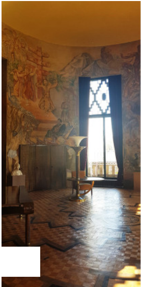
The room of Marshal Lyautey in the Colonial Museum of Paris