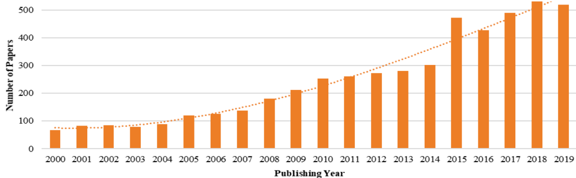
Figure 1. Publications between 2000-2019 related to PPPs and sustainable-related issues.

The evolution of the research agenda of sustainability within PPPs over the last two decades was depicted in Figure 1. This agenda has systematically grown over time from 67 papers in 2,000 to 520 in 2019, demonstrating that the sustainability dimension has gained momentum and importance worldwide, especially in the last decade. Figure 2 shows a chronological evolution of sustainability within the PPP research agenda based on the countries where the research has been conducted in the last decade. The geographical epicenter of the research agenda has shifted from the traditional developed on English-speaking countries such as the US, United Kingdom, and Canada at the beginning of the decade, to medium-size developing countries in Africa, Asia, and America such as Tanzania, Ghana, Nigeria, Vietnam, and Colombia. On the other hand, in the mid-2010s, there is evidence of a transition driven by some of the biggest developing countries such as China and India, and other developed countries from Oceania and West-Europe.