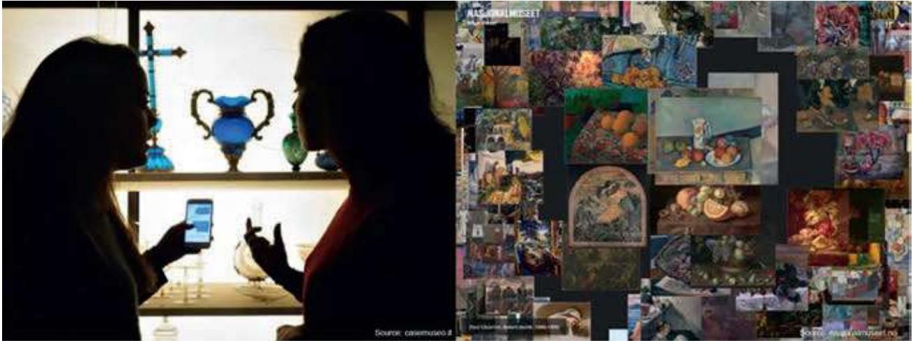
Fig. 7. Use of a chatbot to guide visitors at the House Museum, Milan (left); AI application for comparative work in the collection of National Museum of Oslo (right).

improve the visitors' experience, as is the case at the House Museum in Milan 12 (fig. 7, left). Through automated conversation in clear language, programs based on artificial intelligence can share information with visitors about works of art, making them curious and answering their questions. Furthermore, with the idea of bringing museums closer to people who are not used to visiting such places, this technology offers the possibility to ask any question without the fear of being judged.