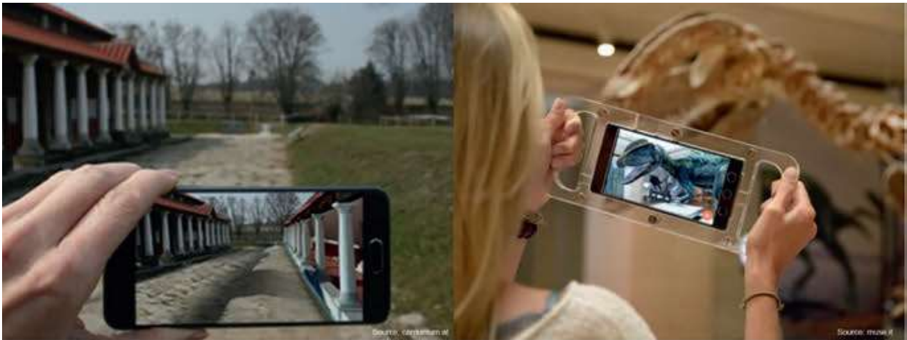
Fig. 2. Archaeological Park of Carnuntum (left), MuSe of Trento (right).

dimension with infinite possibilities and applications while keeping the real world at the centre. AR is undoubtedly the fastest growing technology of this type. It is implemented in many museums and archaeological sites thanks to its ease of use. For example, it can virtually reconstruct buildings that are now partially or totally destroyed, bring extinct animals back to life 3 , recreate ancient battles, or digitally restore precious paintings (fig. 2). Together with narrative techniques, AR can also bring heritage sites and events to life rationally and emotionally during tours. 4 Last but not least, among the applications of AR in museums we find video games 5 , which can stimulate the public, especially children and adolescents, and incentivize them to learn about culture. 6