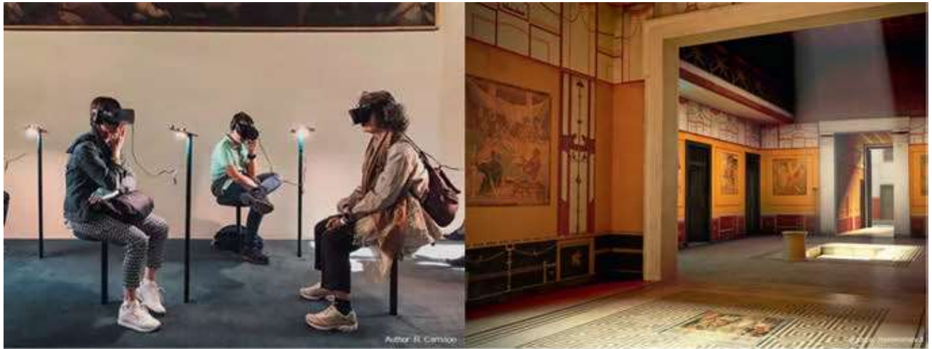
Fig. 3. People wearing VR visors in a museum (left), 3D reconstruction of a house in Pompei at MAV (right).

and Herculaneum just before the fatal eruption of Vesuvius in 79 (fig. 3, right); at M9 in Mestre, the audience can explore kitchens from the early twentieth century, then from the 1930s, 1950s and 1960s onwards using a joystick and even interacting with represented objects.