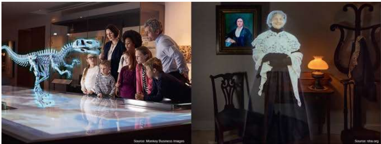
Fig. 5. Holograms in museums.

reality superimposed on a reconstruction of the past, accompanied with audio and video guide. An example of this is the solution implemented in the Roman archaeological park in Brescia 7 (fig. 4). This case proves how new technologies and targeted narrative techniques can play a crucial role in improving access to cultural heritage access and facilitating its appropriation. Holography is another effective tool for boosting learning through interaction and public engagement, especially when combined with narrative components and compelling animations. Although it is still scarcely used in museums due to high cost and complexity of implementation, three-dimensional images produced using this technique can replicate reality and produce fictitious representations thanks to optical illusion. Holograms can produce three-dimensional representations and animations of objects that were destroyed or lost, as well as archaeological findings, people, documents and other traces of the past 8 that are no longer visible (fig. 5).