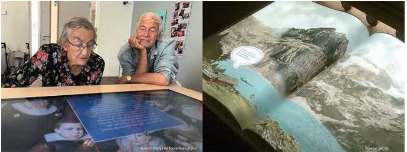
Fig. 8. Touchscreen tables in a nursing home in the Netherlands (left); video projections on an interactive book at the National Museum in Zurich (right).

Finally, new technologies include 360° and video mapping projections. Such immersive solutions are rapidly evolving and accustoming people to enjoy digital content in public spaces and buildings. These projection systems are suitable for collective appreciation in different environments: on surfaces that are not necessarily flat (often being circular, spherical or cubical) or on existing and newly created three-dimensional objects. These technologies make it possible to transform any surface into a dynamic display, creating highly involving and immersive effects for the spectator. A good example is one of the four interactive books in the National Museum in Zurich (fig. 8, right), which allows visitors to explore the nation's stories and events.