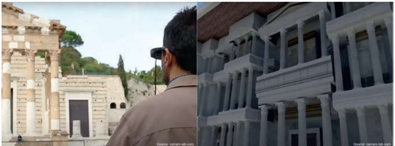
Fig. 4. Use of Mixed Reality at the Roman Archaeological Park in Brescia.

With the help of smart glasses and other tools, MR allows information such as images, data, audio and video files to be shown on the display of the lenses. Visitors wearing special glasses can see