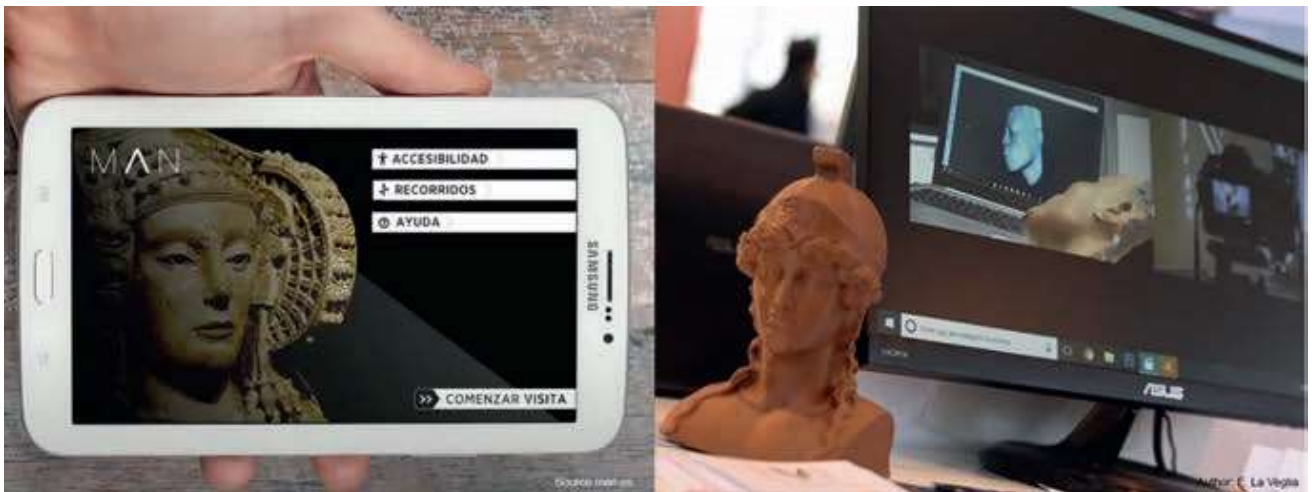
Fig. 6. Audio guide from MAN Madrid (left), use of 3D digital models in an archaeological museum (right).

One example of this is the multimedia guide and app at the National Archaeological Museum of Madrid 9 (fig. 6, left). Both offer a general tour of the museum, including audio commentary, images and videos with subtitles. They also suggest specific itineraries for people with visual impairments and link to videos with information in sign language. While traditional audio guides allow the user to listen to information and stories, new multimedia devices allow for much greater interaction, supporting and engaging different audiences that range from the youngest to the disabled.