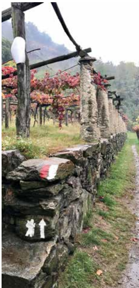
figs. 1-2 – Settimo Vittone (TO). Via Francigena signposts in the middle of terraced vineyards.