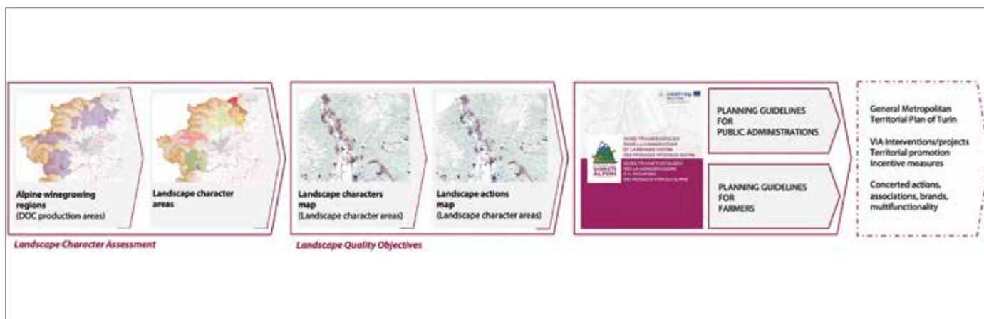
fig. 3 – Research methodological framework (graphic elaboration by the authors).