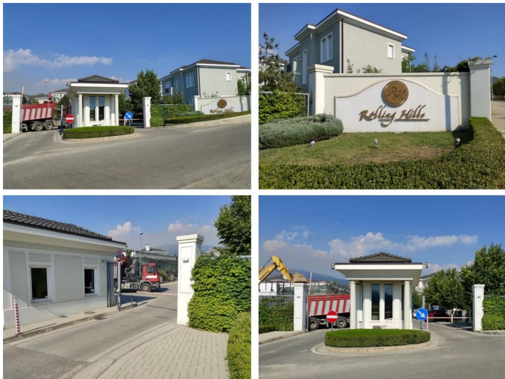
Figure 2: Rolling Hills, a gated community in Tirana, Albania.