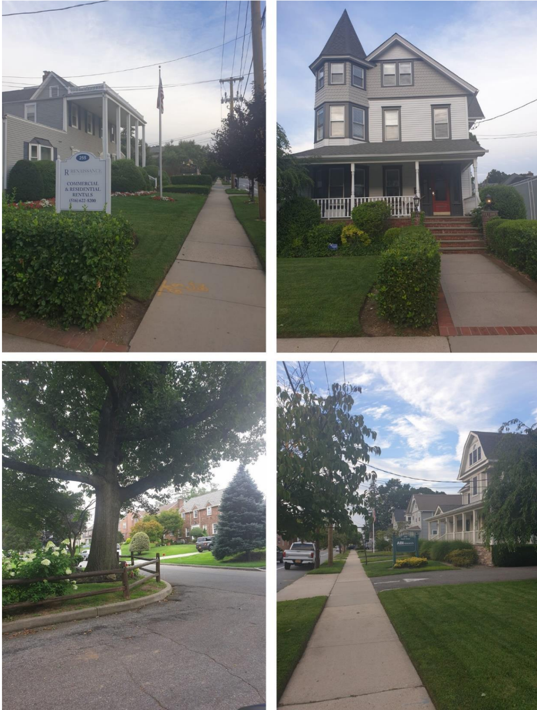
Figure 3: Gated residential areas in Nassau County, Long Island, New York, US.

The erosion of both public space and the threshold concept at the expense of public space, but for private use, is a hybridisation that is worrying because of the mutagenic form it is taking, as also noted by Ergun and Kulkul (2018). The Anglo-Saxon countries, including Great Britain, continue to be the workshops for these urban processes. The latter is the originator of, among other things, the ambiguous Privately Owned Public Spaces (POPSs) (Garrett, 2015a) and directives such as Public Space