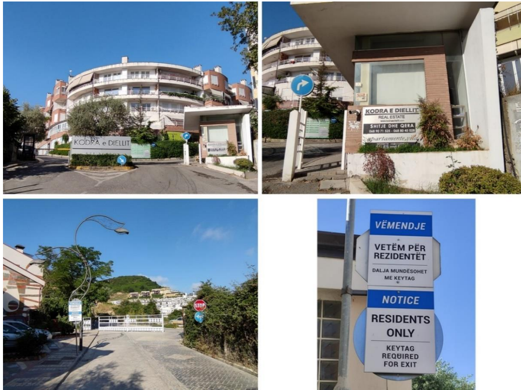
Figure 1: Kodra e Diellit 1, a gated community in Tirana, Albania.