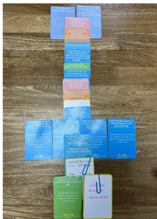
Figure 3. Ranking of indicators according to the SRF method—workshop Part 2.

placed four indicators on the fifth level with the same importance and they decided to use one white card between the tenth and eleventh position of the ranking. Finally, they also decided to place the same importance on the last two indicators (positions 19 and 20). With this in mind, the column “Position” in Table 6 shows the place (from the most to the less important) of each indicator after the application of the playing cards. The rows with more than one value represent indicators that were placed with the same importance in the ranking, such as Ambient air quality concerning PM2.5 over one year and Natural disasters risk management sharing the position of the most important indicator.