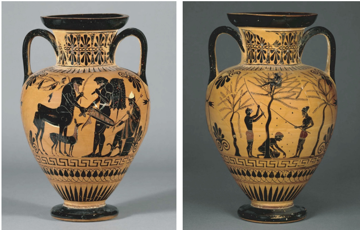
Fig 1. Black-figured amphorae (The British Museum, 2022)