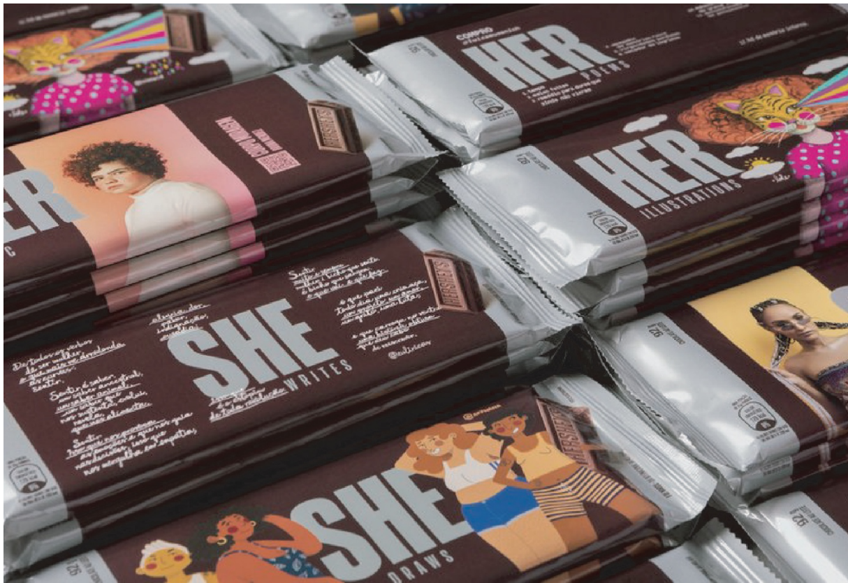
Fig 2. Her / She campaign for International Women's Day (BETC Sao Paulo Agency, 2021)

proposed as a reflection and review - in a broad sense - of the Sullivanian legacy, highlighting the contemporary need to rethink the overall practice of the project, in favor of a more - however not exclusively - poetic, experiential and technological design. A conversion in favor and also in support of the emergency.