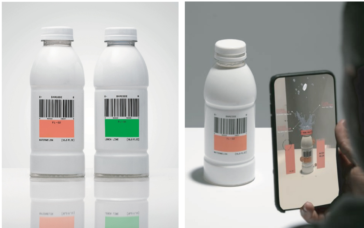
Fig 3. Sustainable Sports Drinks and packaging with integrated AR experience (Barcode, 2022)

educational practices, tangible and shared. Practices fundamental to inclusion as opposed to exclusion, in favour of uniqueness in response to diversity [fig. 2]. Practices helpful to create a sense of belonging, to create community [fig. 3].