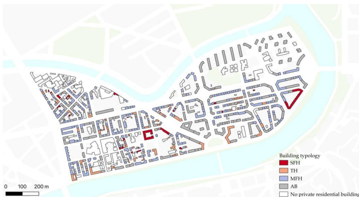
Figure 2. Building characterization according to the typology.

to categorize buildings according to the building envelope and heating systems, as also suggested by the TABULA project. The buildings thus classified constitute the evaluation alternatives of the multi-criteria model. In Figure 2, the buildings are shown according to their building size class. As can be seen, the neighborhood is mostly occupied by apartment blocks, as supposed given the high density of housing.