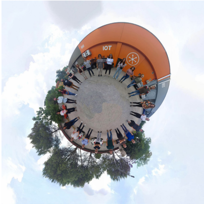
Fig. 2. Panoramic photo with participants of the UID PhD Summer School 2022.

Solutions / La comunicazione e valorizzazione del Patrimonio Culturale mediante l'utilizzo di soluzioni open e web-based.