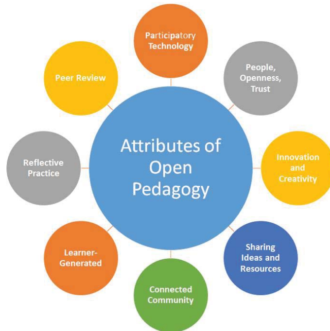
Figure 4. Eight attributes of Open Pedagogy [1]

This has been brought about by connected communities through the internet and digital technologies. Participants will be encouraged to be adaptive to stimulate innovation and creativity using these features.