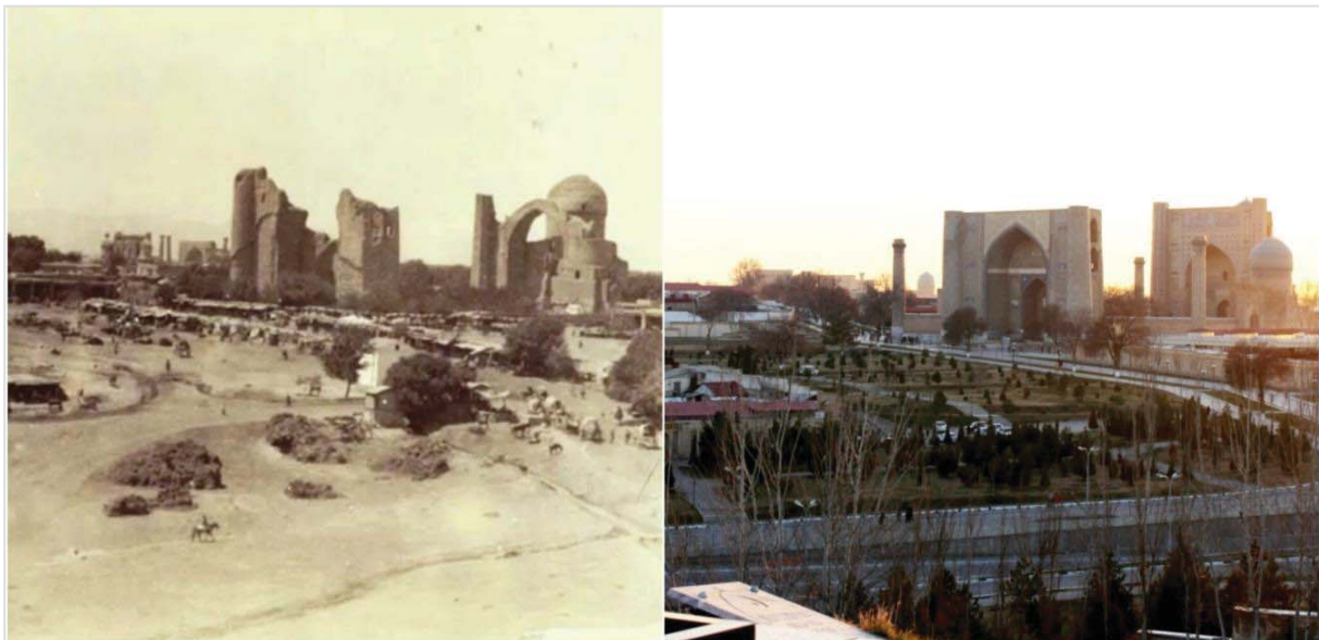
Figure 1: Renovated Bibi-Khanym mosque [9]

The main environmental issue, in almost all historical cities, is salt attack to foundations or underground facilities of historic and residential buildings. Salt attack is a result of high groundwater tables. The groundwater table is high in almost all historic urban areas and this is mainly due to mismanagement and inappropriate functioning of sewage and water supply systems. Due to these environmental impacts, the historic urban fabric has lost many of its traditional houses and monuments. Moreover, many historic buildings, including the residential ones, are seismically unsafe. Most people live in traditional houses and the local authorities do not have the necessary knowledge and expertise to restore and retrofit them. In the 1990s, Tashkent Research Institute of Restoration was abolished and subsequently the number of masters graduates and specialists have diminished.