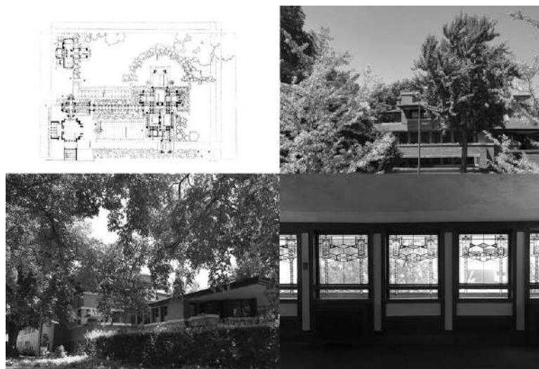
Figure 3. Drawings by Frank L. Wright and

Le Corbusier, whose image as an innovator is encapsulated in the astuteness with which he was able to steal references from the characters and figures of reality and reintroduce them into the world around him, 38 never abandoned his intention to build a house for the soul. It is obvious, in my opinion, that he would not have been able to promote himself if he had said: “Mes projets sont des projets pour la nature! Ces projets ne sont pas destinés à l’homme nouveau qui désire la voiture.”