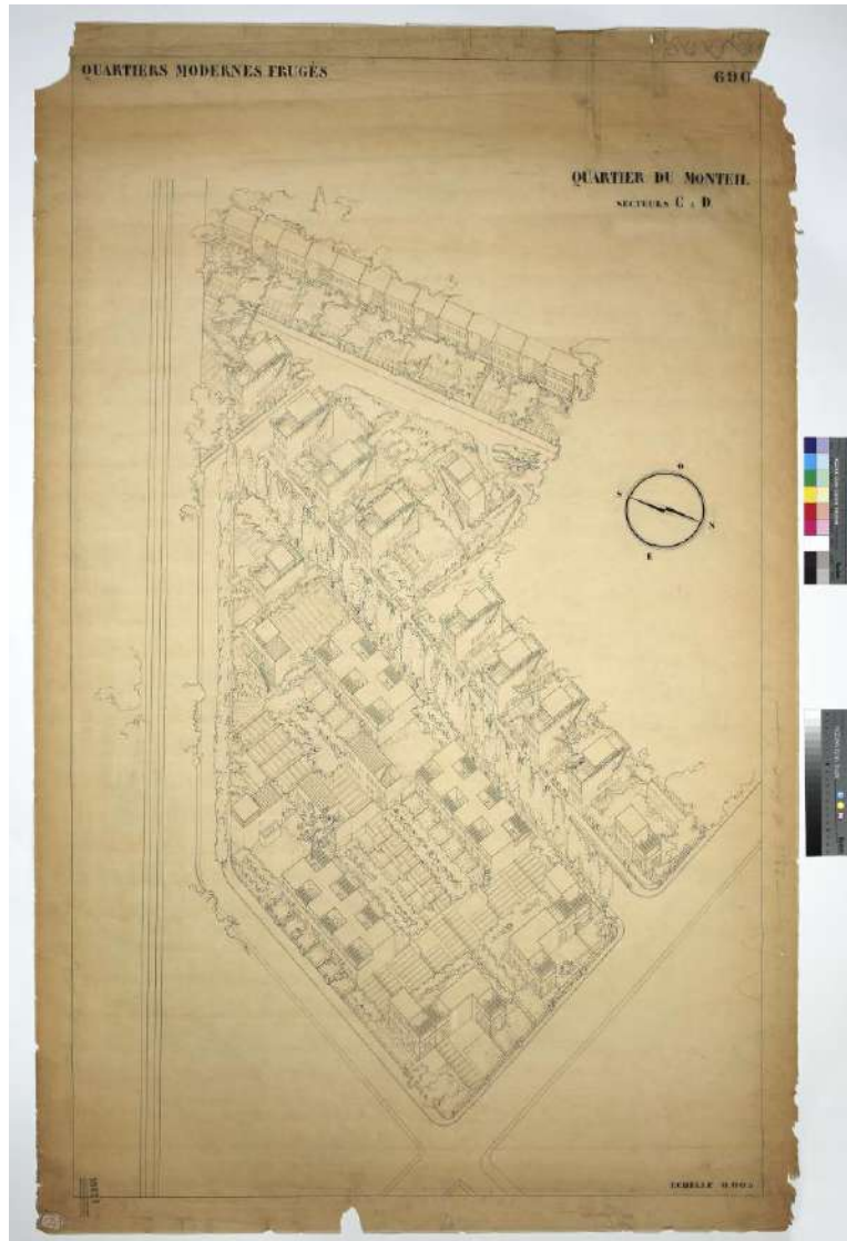
Figure 4. Le Corbusier (Jeanneret, Charles-Edouard 1887-1965), Quartier Modernes Frugès, Pessac, 1924. Encre de Chine sur calque cuir, 100 x 170 cm.