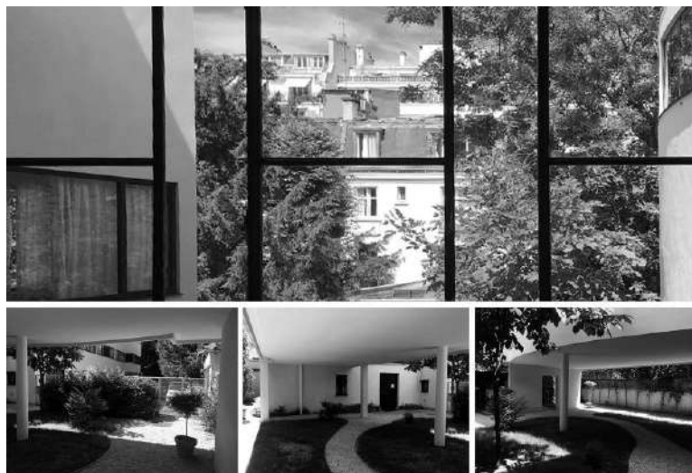
Figure 5. Pictures of Maison La Roche by Thomas Pepino