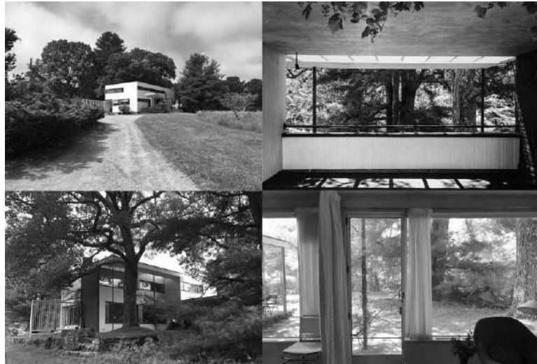
Figure 2. Pictures of the Gropius House