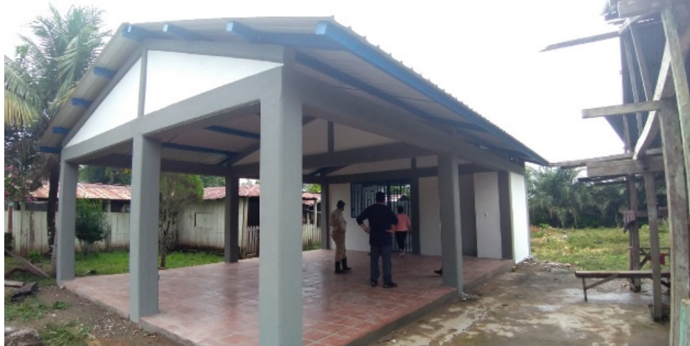
FIGURE 5. Community center of Sabanas de La Fuga. Photo by authors, 2020

The sloped roof responds mainly to the ease of construction and low cost of the system. In the case of San José del Guaviare, which is a highly rainy municipality with a deficit of potable water in the rural area, sloped roofs offer the possibility of implementing rainwater collection systems, which were not considered. Likewise, the rural area of San José del Guaviare does not have electricity coverage, but the radiation levels offer the possibility of implementing solar energy systems, which were not included either. Despite of this, the community centers were built and delivered with the networks ready to be connected to the public systems, ignoring the deficit conditions, and implementing technical solutions for an interconnected place such as a town center.