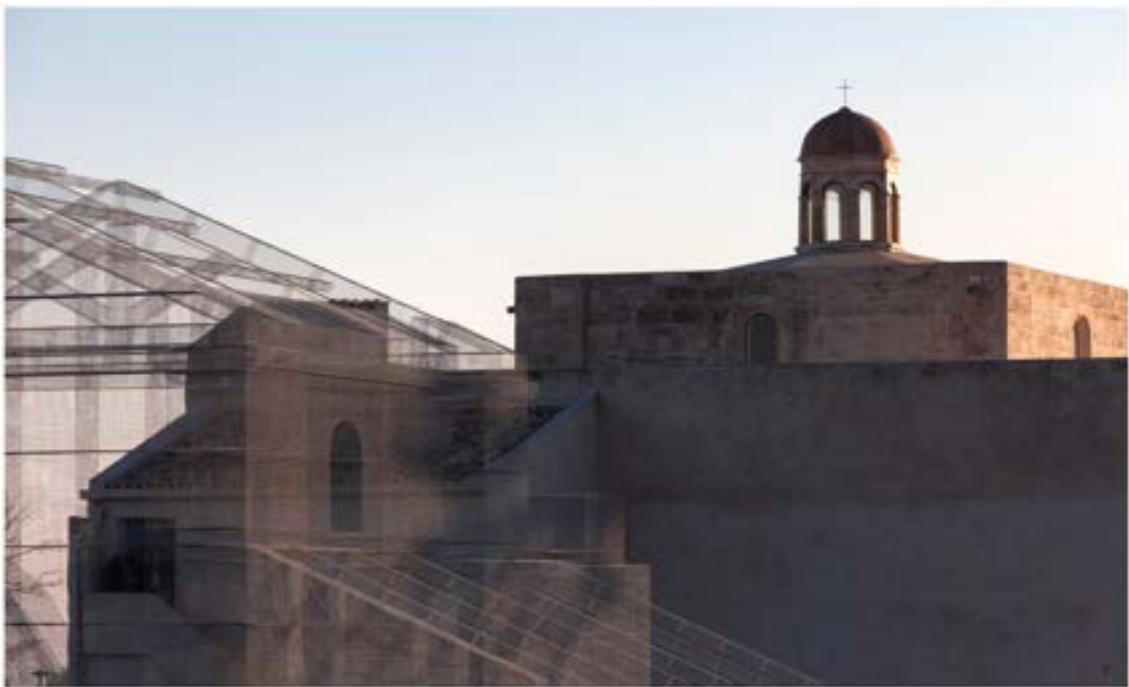
Figure 4: Basilica di Siponto by Tresoldi.

The processes of re-materialisation of data, or in general digitalization, in these cases started from a physical form where is possible to interact. Therefore, the focus is, above all, on the emotional aspects of perception. The trust relationship between the user and the author is based on the authenticity of the experience, involving emotional aspects. The interaction, indeed, happened not only with cognition or rational interpretation but also with perception.