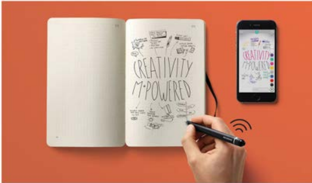
Figure 1: Smart writing set by Moleskine. From: https://www.wired.it/gadget/accessori/2016/04/08/set-moleskine-per-appunti-su-carta-tablet/

the process can be either whole reconfigured, such as writing through a keyboard, or simulated, in the case of the tablet with its electronic pen. In the first case, the experience with the material tool requested the distancing from the previous model and the acceptance of the new one. In contrast, in the second case, the experience of writing remains almost unchanged.