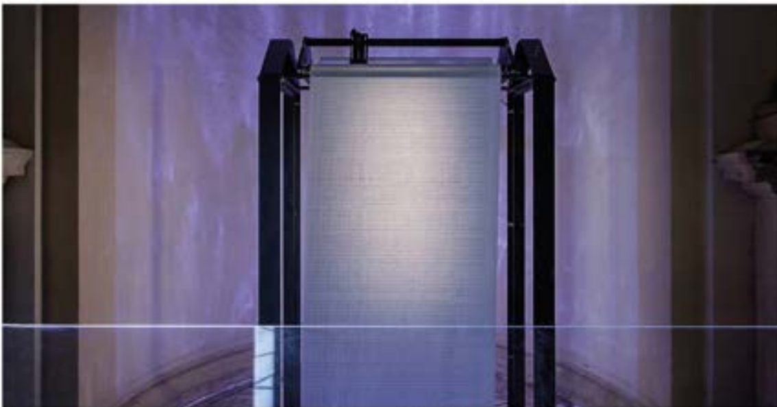
Figure 3: Ultravioletto, Neural Mirror. From: https://ultravioletto.to/fondazione-carla-fendi-neural-mirror/