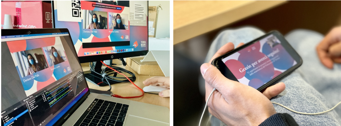
Figure 1. On the left and on the right, the digital festival “Terra Madre - Salone del Gusto 2020”.

Moreover, the events online are very “light” from an environmental point of view (no paper, no travel, no flyers, no posters have been produced). All communication was done online through the social channels and the website of the MATto materials library; in addition, the guests and partners of the project constantly disseminated the activities through their communication and dissemination channels.