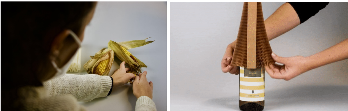
Figure 2. On the left and on the right, some examples of manipulation of the materials samples, in order to replicate the materials experience digitally.

The activities have been all managed from MATto headquarters: in fact, the knowledge of the materials is based on the physical experience (manipulation and observation) of the samples and the analysis (of their characteristics and properties - techniques but also expressive-sensory) and study about them.