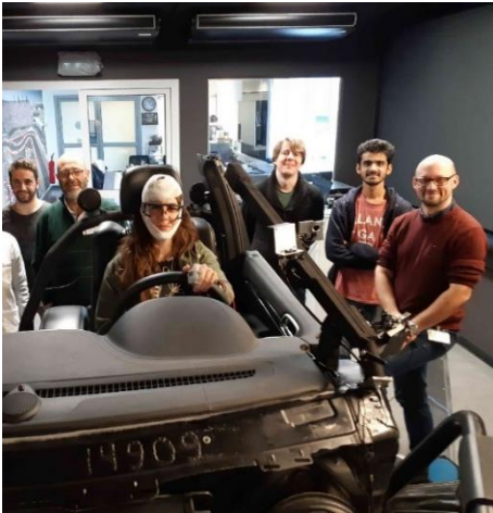
Fig. 1. AVL driver simulator, Graz(AT) [19]