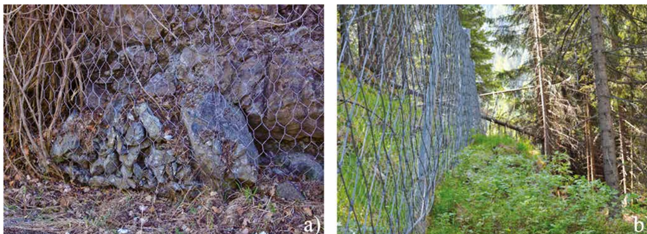
Fig. 2 – Accumulation of debris, due also to impacts with energy smaller than the design one (a), and impacts of element differing from rock blocks, i.e. trees after some severe or unexpected climatic events (b).

climatic events, represent recurring situations highlighted during inspections (Fig. 2).