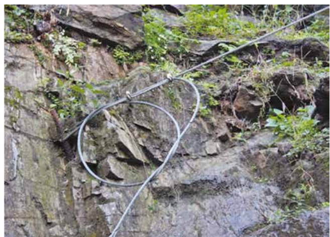
Fig. 1 – Installation errors, and unsuitable or not certified technologies.