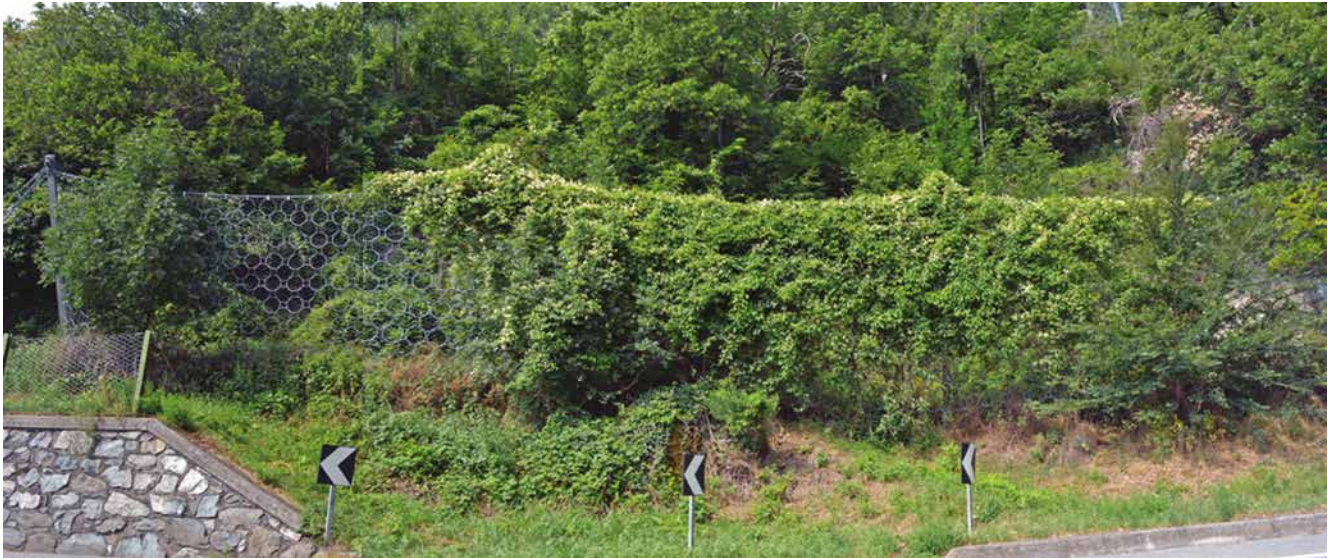
Fig. 6 – Presence of dense vegetation.

conditions, even human-driven, can reduce the expected working life significantly. Consequently, a quick-assessment procedure to evaluate the state of conservation and to define the need of maintenance can provide a profitable solution to manage and plan the maintenance, especially for Authorities who have to administer a huge territory.