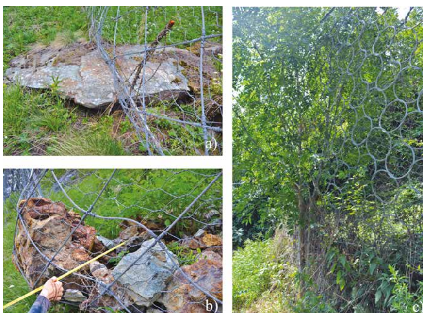
Fig. 4 – Frequent observed damages: voids at the foot of the barrier (a), debris/blocks/notches in the net (b), and elements limiting the deformation capacity of the barrier (c).

The definition of a service life for rockfall protective measures represents an issue difficult to tackle. Environmental and external