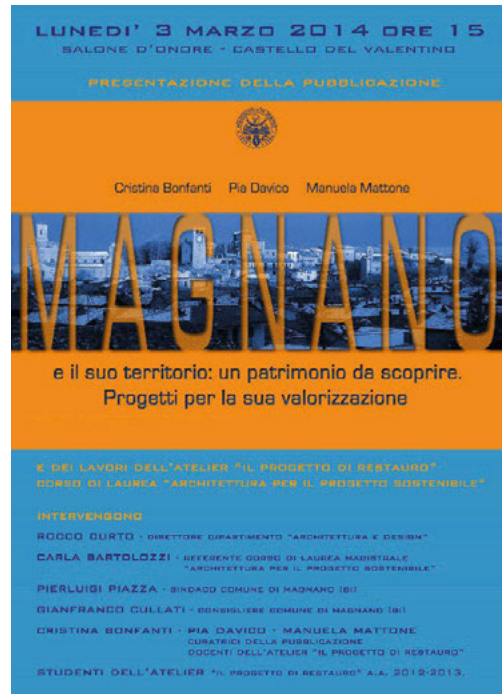
Fig. 3. Poster of the public presentation of the results of the Atelier "Compatibility and sustainability of architectural restoration".

Taking up the sociological concepts described by Barry Schwartz 8 , reinterpretation of the identified values through the three phases of keying, framing and modelling places the student/mediator in a preferred perspective position providing a complete and sophisticated overview concerning the involved stakeholders. The first phase of keying is identified with the territorial analysis, while the second phase of framing corresponds to the data interpretation for the preservation project; the third phase of modelling can be identified as the one in which the students translate their analysis into a project proposal. As per expectations, the most critical stage is the second one, as the framing process implies using all the taught paradigms to understand and investigate the boundaries of the conservation and reuse project (Hoadley, 2006). This process is the critical translation of the theoretical framework into the design practice, where the selection process is the most difficult to be communicated through the preservation project (Hoadley, 2006).