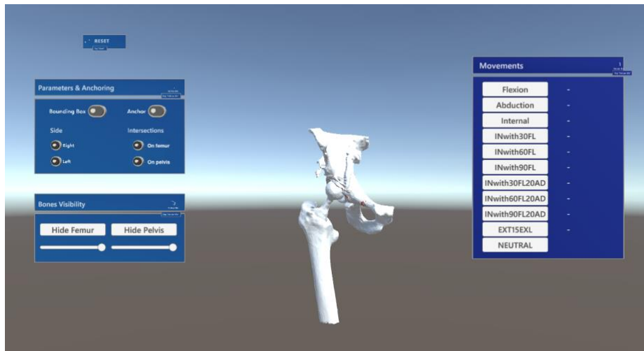
Fig. 1. Unity scene view of panels and holograms at Start.

A prototype has been developed in Unity 3D and then deployed on HoloLens 2 ( https://docs.microsoft.com/en-us/hololens/hololens2-hardware ). As seen in Fig. 1, interaction with the AR application occurs through three main panels. Users define to which hemi-side of the patient the loaded 3D models belongs (Parameters & Anchoring), choose which movement to simulate (Movements), and sets on which model to visualize the intersection, either pelvis or femoral prosthesis, and their transparency value (Bones Visibility).