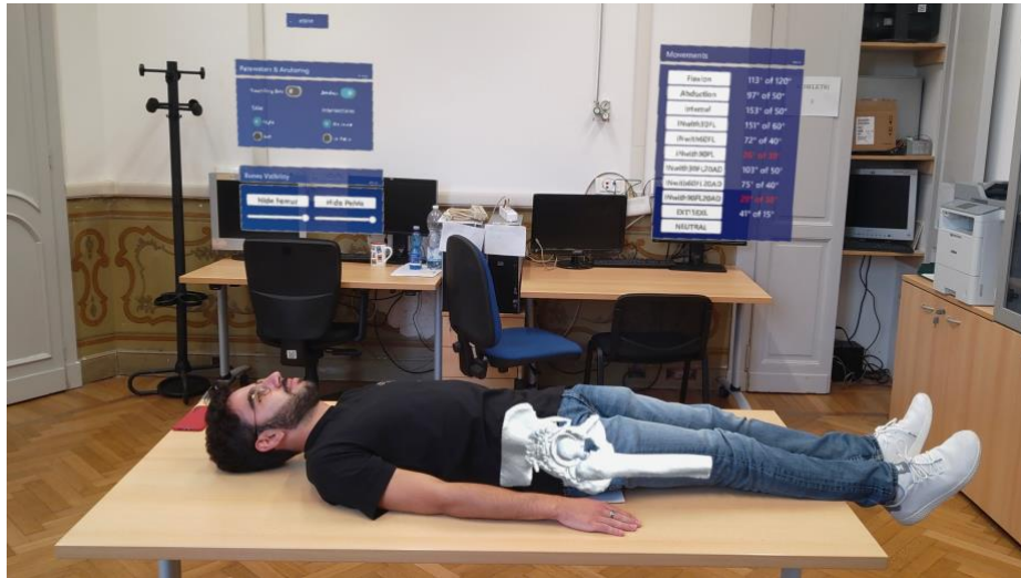
Fig. 2. 3D model anchored to the patient hip joint while lying on his back.

is reported. The impingement zone at the limit of the movement comes coloured red by the simulator and displayed alternatively on the pelvis on the femur model ( Error! Reference source not found. ).