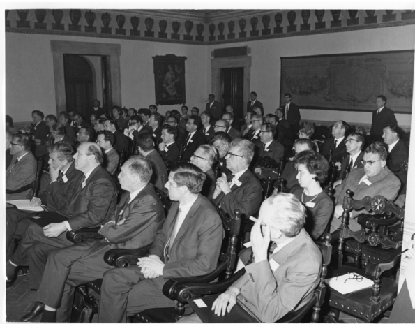
FIGURE 2 Participants at the Pisa meeting in April 1966

Italian government. Sponsored by the president of the Italian Republic, Giuseppe Saragat, the meeting was attended by about 90 physicists (Figures 1 and 2). 42