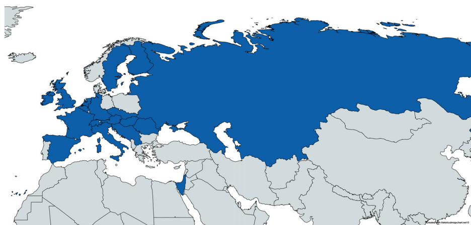
FIGURE 4 National membership of the EPS, as represented by the official national bodies that signed the constitution on September 26, 1968. This map has been realized using historicalmapchart.net ( https://historicalmapchart.net/world-cold-war.html ), retrieved June 20, 2018 (CC BY-SA 4.0). National borders in historical periods were, of course, a matter of political controversy and diplomatic negotiations. This is certainly the case for the identification of the Sinai region as part of the Israeli state after the Six-Day War. The author does not intend to make, or share, any claim concerning the geopolitical description conveyed by the tool employed. This is simply a representation of the membership of the EPS in 1968 [Color figure can be viewed at wileyonlinelibrary.com ]

the EPS. 112 Whatever position they expressed during the discussion, everyone agreed that, in this more strategic sense, founding the society was itself a political act. Even though some protested, the final decision was to found the society as planned, with only a weak mention of the ongoing political situation in the letter of invitation to scientific institutions.