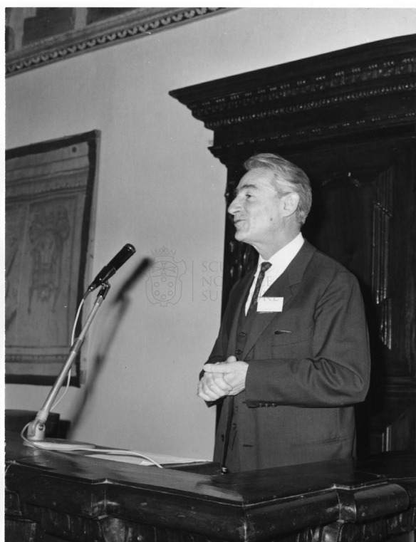
FIGURE 1 Gilberto Bernardini addresses the audience at the Pisa meeting in April 1966, Raccolta fotografica Scuola Normale Superiore, Meeting, Meeting on European Collaboration in Physics 16-17 Aprile 1966, Centro Archivistico della Scuola Normale Superiore, Pisa, Italy