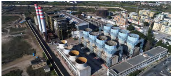
Figure 1 The ex-thermoelectric power plant of Bari (see online version for colours)

The thermoelectric power plant of Bari is characterised by a large size (around 60,000 sqm) and it is in a favourable position in terms of connections and accessibility being placed in an industrial neighbourhood near the city centre and not far from the seaside. Currently, the buildings on the area are in discrete conditions, except for the northern part belonging to the three tanks for fuel oil storage, which shows huge damages related to the fire occurred in 2013 as well as high levels of soil pollution caused by the fuel oils' spill (Figure 1). Accordingly, the area presents uneven levels of pollution with the consequence that the types of reclamation interventions could be extremely varied.