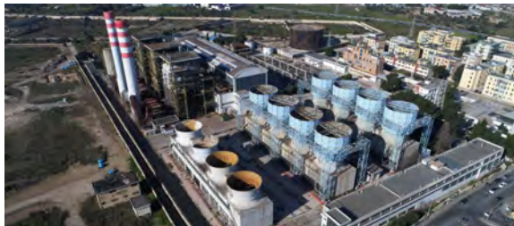
Figure 1 The ex-thermoelectric power plant of Bari (see online version for colours)

The thermoelectric power plant of Bari is characterised by a large size (around 60,000 sqm) and it is in a favourable position in terms of connections and accessibility being placed in an industrial neighbourhood near the city centre and not far from the seaside. Currently, the buildings on the area are in discrete conditions, except for the northern part belonging to the three tanks for fuel oil storage, which shows huge damages related to the fire occurred in 2013 as well as high levels of soil pollution caused by the fuel oils' spill (Figure 1). Accordingly, the area presents uneven levels of pollution with the consequence that the types of reclamation interventions could be extremely varied.