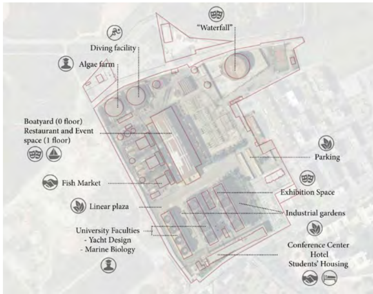
Figure 4 Design declination of alternative A_{12} (see online version for colours)

After having discussed the final ranking with the DM, he decided to investigate alternative A_{12} instead of alternative A_{16} . As often happens in decision-making processes of a territorial nature, the DM has opted for the alternative capable of producing greater profitability. This is in line with the objectives of MCDA procedures that aim to supply a recommendation based on elements of reasoning leaving the DM the ultimate responsibility for the definitive decision (see e.g., Roy, 1993). Moreover, observe in Table 9 that there was anyway a probability of 9.85% that alternative A_{12} could be preferred to alternative A_{16} , so we can conclude that the preferences represented by the