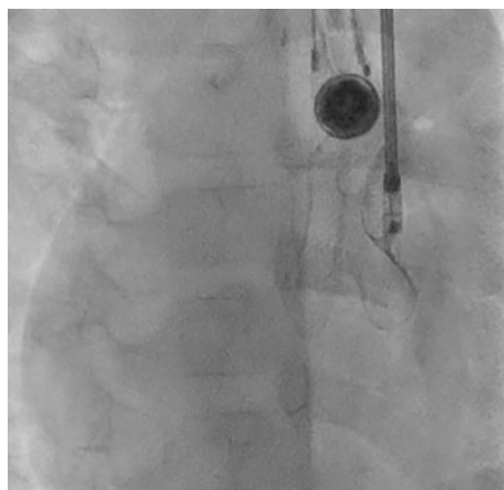
Fig. 2 A 16.5 mm Occlutech Figulla Flex II ASD device was successfully positioned. Note the almost parallel angulation of the device and the Flex Pusher anchored to the Flex II hub