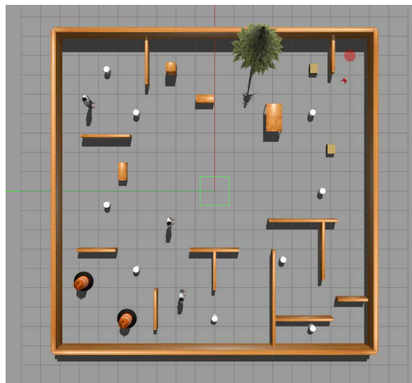
Fig. 1. Representation of a common simulated environment for training an agent. If robot dynamics and task constraints are correctly encapsulated into the simulation, it is possible to deploy on the real setting with minimal loss of performance.

Autonomous navigation is a challenging task in the research area of robotics, which has been tackled with numerous contributions and different approaches. Indeed, global and local path planning [1], [2], localization and mapping [3] are only some of the required tools that each year undergo heavy research from the scientific community to achieve necessary requirements for full automation. Among them, learning methods have been investigated in recent years due to the successful spreading of Deep Learning (DL). In a Reinforcement Learning (RL) framework, an agent learns by experience through the interaction with the environment where it is placed, avoiding the need for a huge dataset for the training process. [4] RL